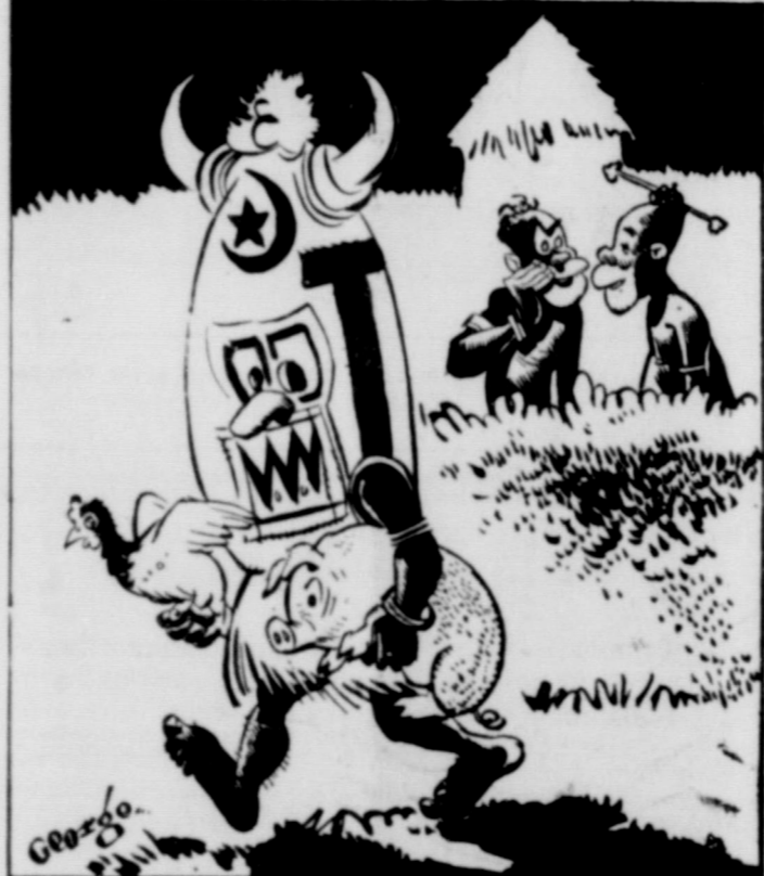
"Doc has an awful time. First he has to frighten his patients into getting well. Then he has to frighten 'em into paying their bills!"