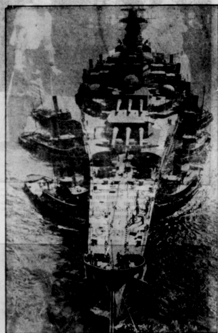
Stripped of her small guns and her turrets in "cocoon," the 45,000-ton battleship New Jersey is tugged through New York harbor on her way to the Bayonne, N. J., Naval Annex for decommissioning. A veteran of Pacific fighting, she will join the Navy's mothball fleet and be held in reserve.