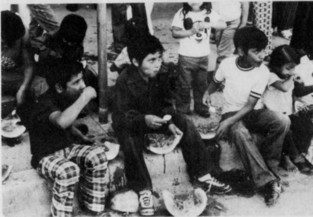
OLD FASHIONED SATURDAY NIGHT in Lockney: gunfights (cap pistol variety), tug-o-war, and watermelon.