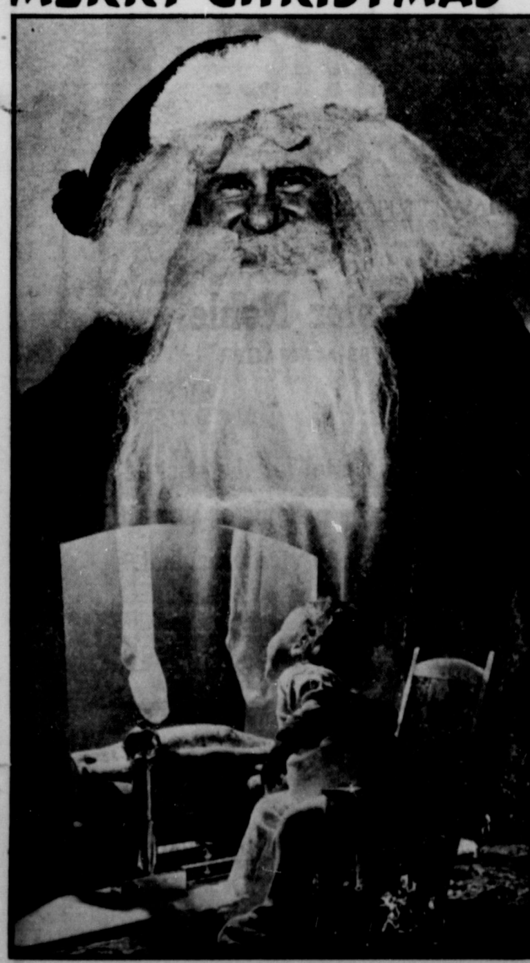
TO ALL THE LITTLE PEOPLE AND ALL THE BIG PEOPLE AT YOUR HOUSE.