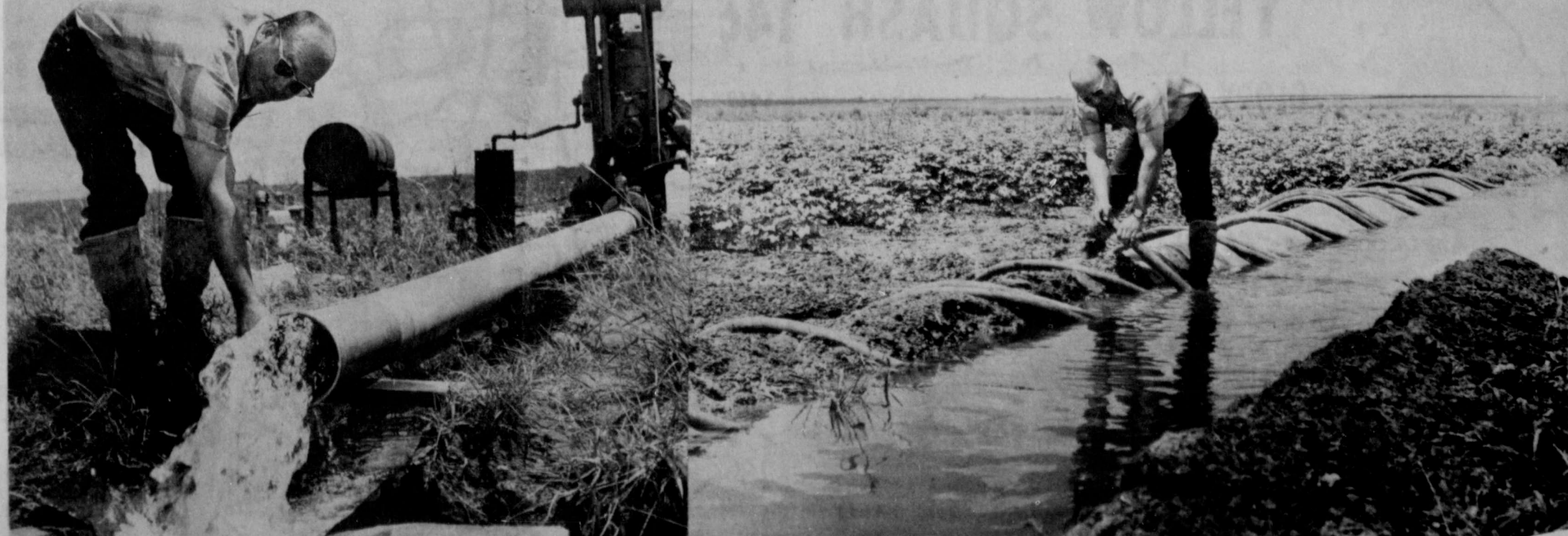
"YEP, IT'S A MIGHTY DRY YEAR"... but there are still some eight inch irrigation wells around the county that are pumping night and day to save a very promising crop. Billy Fulton is pictured on his farm a- bout four miles southwest of Floydada making set on cotton crop.