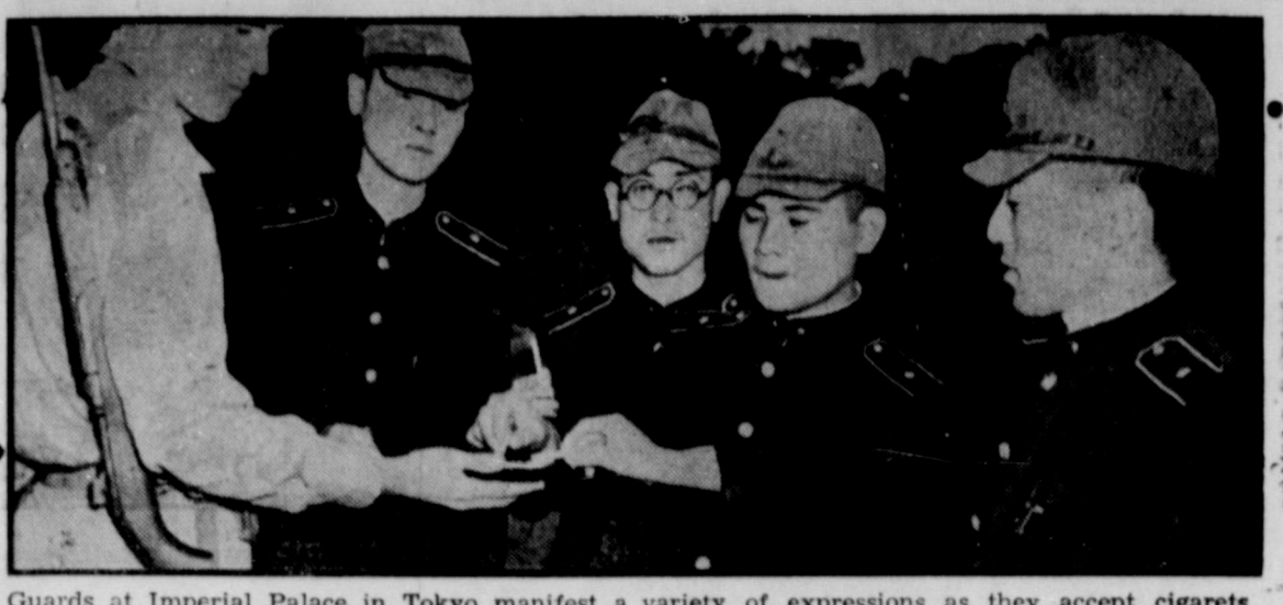
Guards at Imperial Palace in Tokyo manifest a variety of expressions as they accept cigarets from an American soldier.