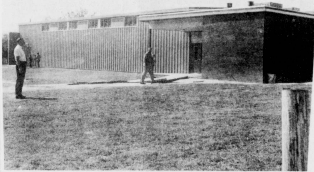
NEW AUDITORIUM AT BAPTIST ENCAMPMENT is now in use as church groups come to the camp grounds in the summer worship and recreation program.