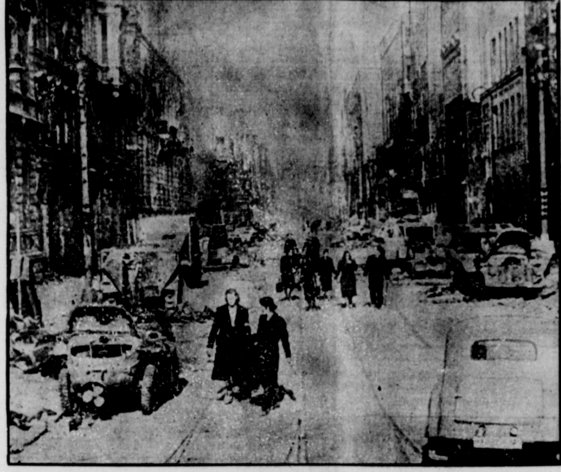
Though fighting has stopped in Berlin, signs of war are still very apparent, as this picture shows: military vehicles, rubble, pedestrians walking in the cleared middle of the street along unused tram tracks.