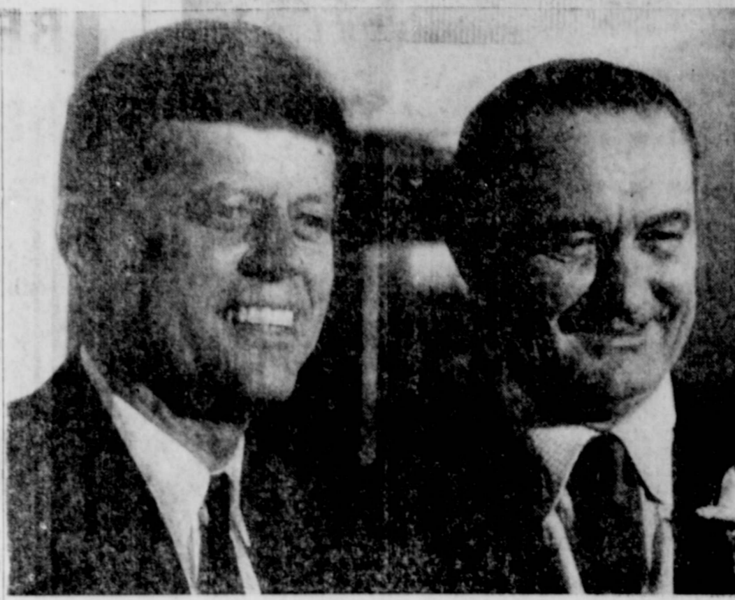
JOHN F. KENNEDY, the new president of the United States, and Texas' Lyndon B. Johnson, vice president, from a recent photograph.