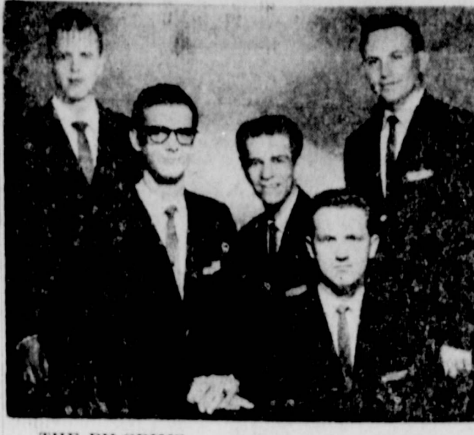
THE PILGRIMS , a most unusual quartet of tenor, alto, tenor and bass vocalists, will appear at the Assembly of God Church for one service only, Thursday, June 30 (tonight.) at 8:00 p.m.