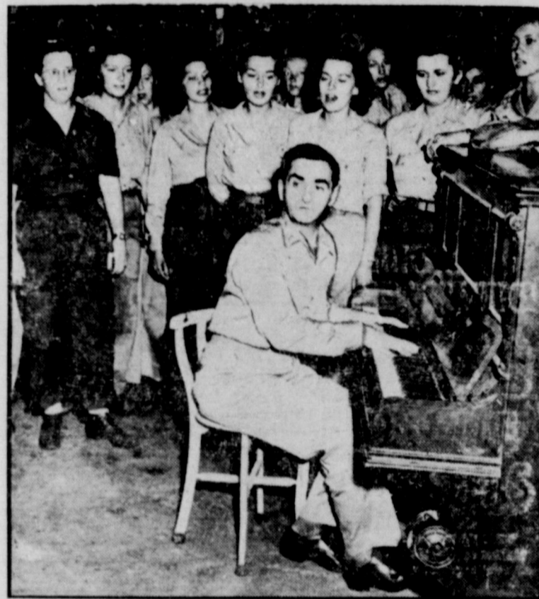
Song writer Irving Berlin plays one of his famous tunes in a WAC messhall at Hollandia, Dutch New Guinea, and girl G. I.'s give out in voice. The one behind him is singing with her eyes closed, a sure sign she's got the call.

Symphony both by the Philadelphia Philharmonic Orchestra.