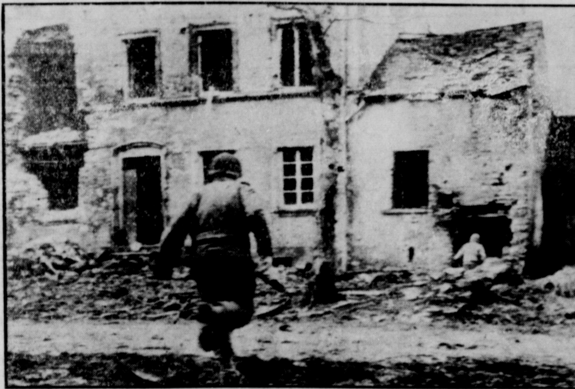
U. S. 3rd Army infantrymen dash for cover in a shell-wrecked house in Sinz, Germany, as German artillery opens fire.