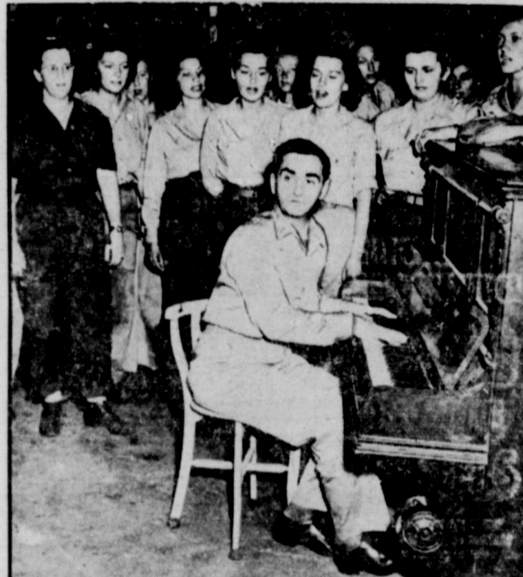
Song writer Irving Berlin plays one of his famous tunes in a WAC messhall at Hollandia, Dutch New Guinea, and girl G. I.'s give out in voice. The one behind him is singing with her eyes closed, a sure sign she's got the call.

Symphony both by the Philadelphia Philharmonic Orchestra.