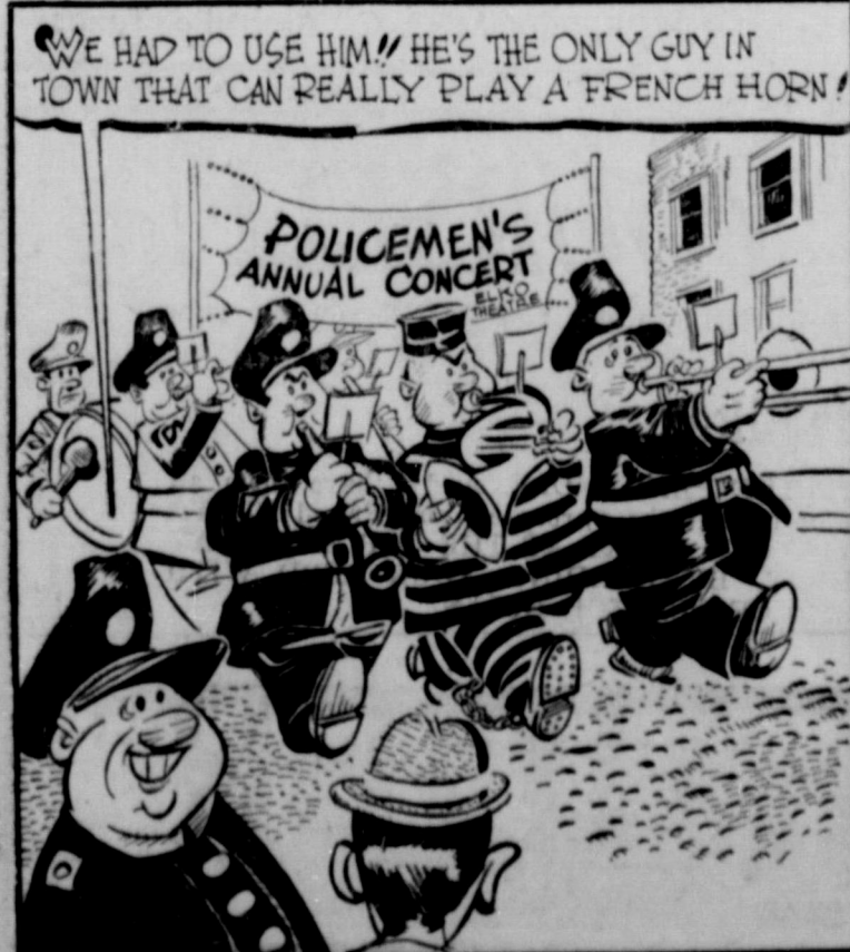
WE HAD TO USE HIM! HE'S THE ONLY GUY IN TOWN THAT CAN REALLY PLAY A FRENCH HORN!