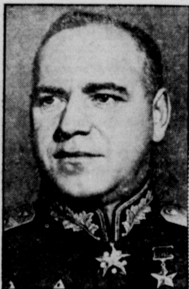
Soviet Marshal Gregory K. Zhukov commands the 1st White Russian Army, now hammering at the very gates of Berlin. The czar's army drafted him at 17 in World War I.