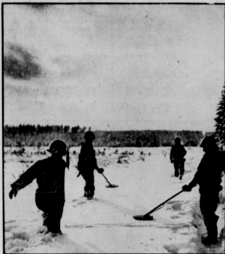
Engineers of the 75th division sweep a snow-bedded road for mines before tanks and infantry move up. The scene is near Commanster, Belgium.