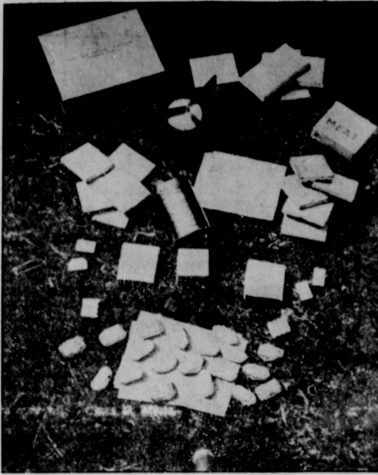
Every Allied soldier landing on the French coast carried 24-hour rations in a small waterproof cardboard box...