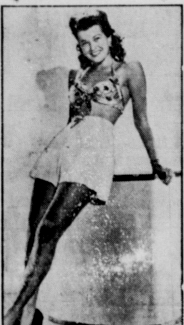
Brooklyn-born Trudy Marshall, formerly a model and cover girl, looks mighty, mighty choice, and you can see more of her soon...