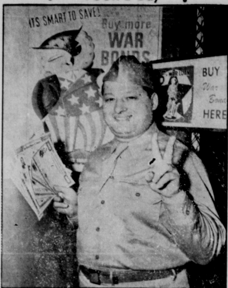
Here's a little something to ponder when you make your decision about how many War Bonds to buy in the Fifth War Loan...