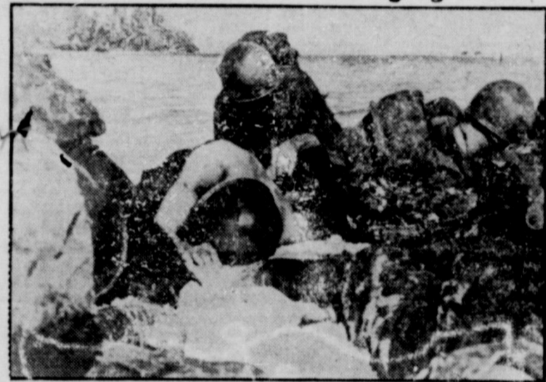
An American trooper is shown administering to a comrade struck down by Jap bullets while breasting the surf in the initial landing at Wakde, Dutch New Guinea. The casualty was held up and pulled ashore by soldiers around him, who are shown, left and right, flattened to the beach to escape the fusillade. Only the first aid man's head is up. He's risking death to keep the wounded man alive.