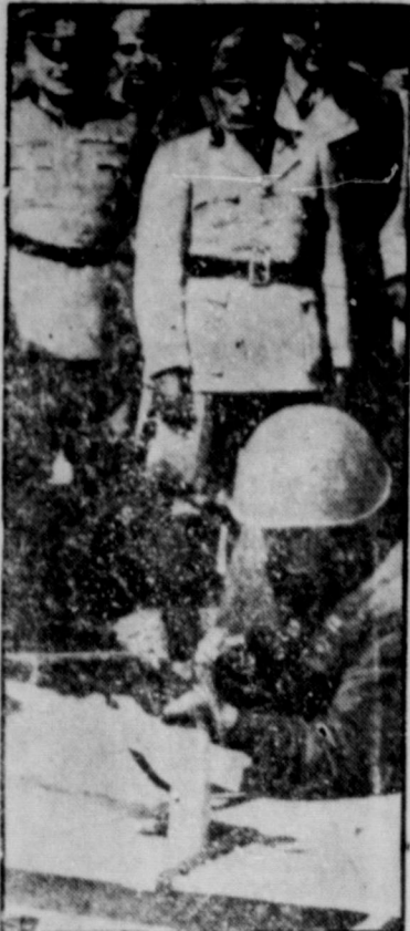
Somewhat thinner than of old, Mussolini still wears his bulldog look as he pauses to watch a still-toys Fascist doll...