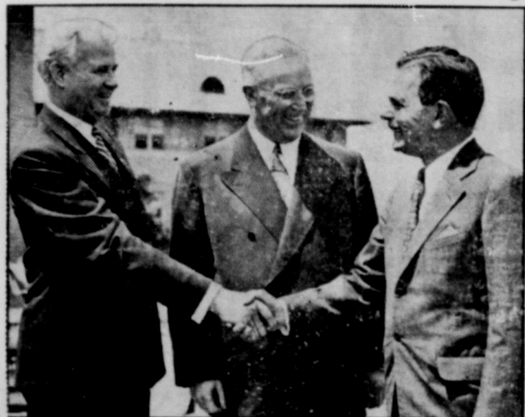
Gov. John W. Bricker of Ohio, left, says Gov. Thomas E. Dewey of New York eliminates himself from the Republican presidential nomination contest...