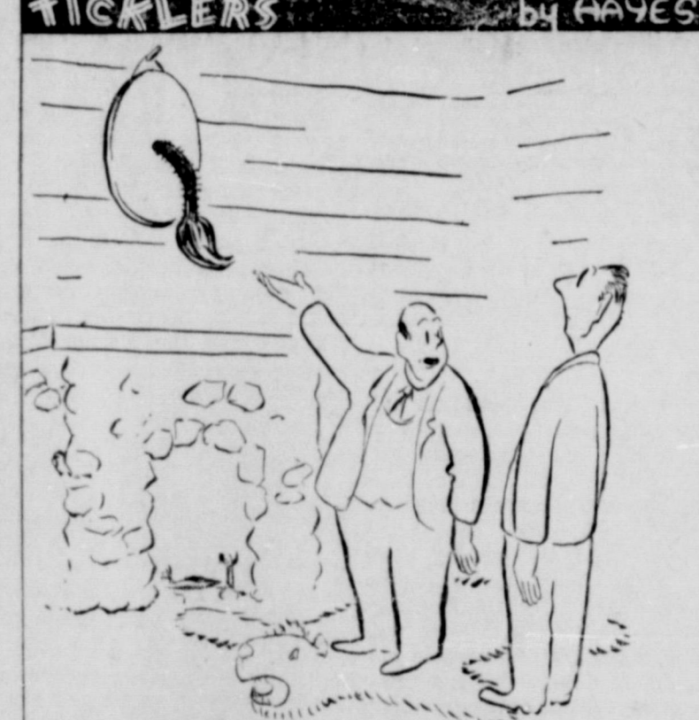
"We tossed for the head and I lost."

Well, I'm fairly well settled about-except rationing. Good