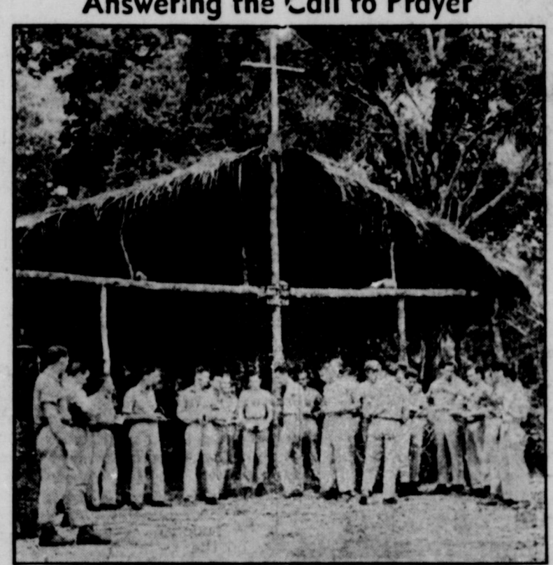
American soldiers at a South Pacific base worship at the Chapel of Our Lady of Loreto. They built it themselves-for Catholic or Protestant services. (Passed by censor.)