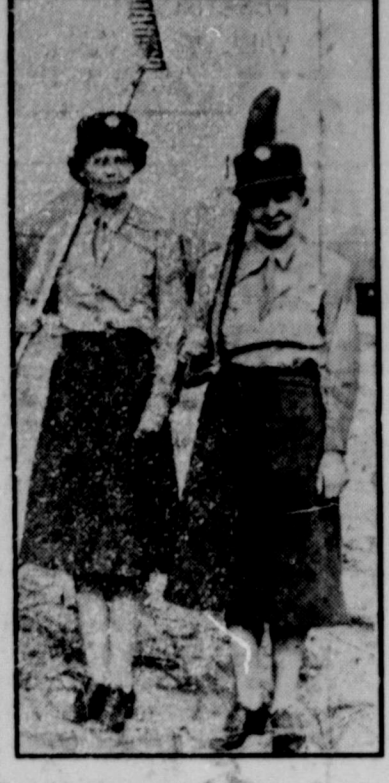
There are no frills in the WAAC sizing room at Daytona Beach, Fla., the trainee at left finds out while getting into her new uniform. And being a WAAC is no pink tea, either, say the shovel and rake armed pair of "street police" at right.