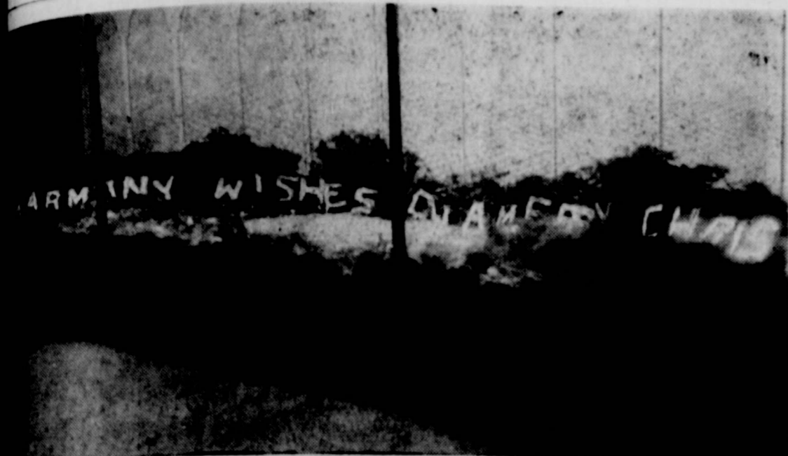
Christmas Salute. Here is the street view of the Harmony community display in the window of Floyd County Rural cooperative's window during the Yuletide season...