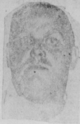
GUS HALL, 40

The FBI has requested the assistance of alert citizens and law enforcement agencies in locating Gus Hall, National Secretary of the Communist Party, U. S. A. He is one of the Communist Party leaders who have been convicted of the Smith Act and are presently fugitives from justice. A description of Hall is as follows: