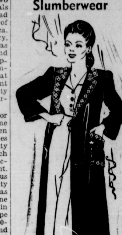
A yellow satin gown with Navy piping under a Navy romaine crepe bedroom coat trimmed with embroidery-it gives that luxurious feeling.