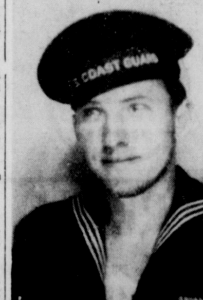
Somewhere in N. W. Africa, Friona Star.