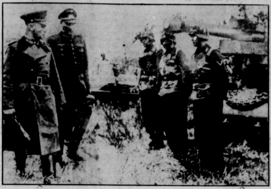
Carrying his marshal's baton, Nazi Field Marshal Erwin Rommel, boss of Hitler's invasion defense, is shown inspecting tanks and crews in France in this picture, received in the U. S. via a neutral source.