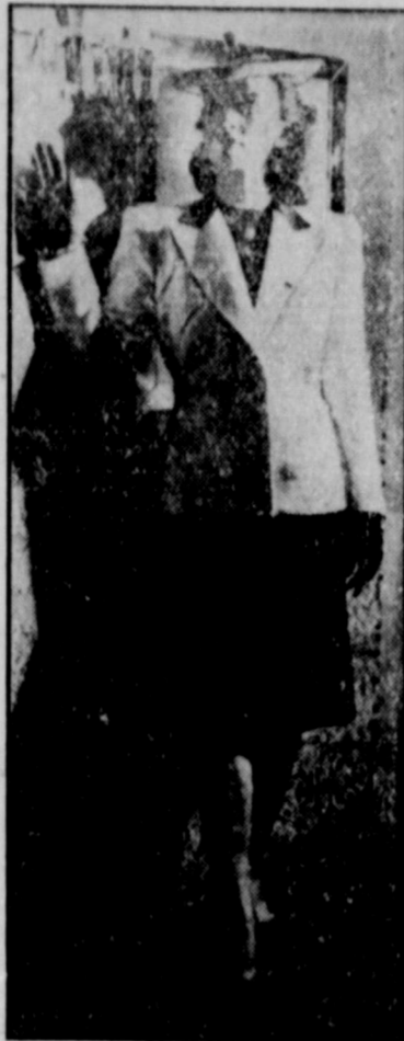
Trim, simple lines but soft and feminine is the formula of this man-tailored cashmere wool jacket and skirt and Breton hat. Petal-pink and black are the suggested colors.