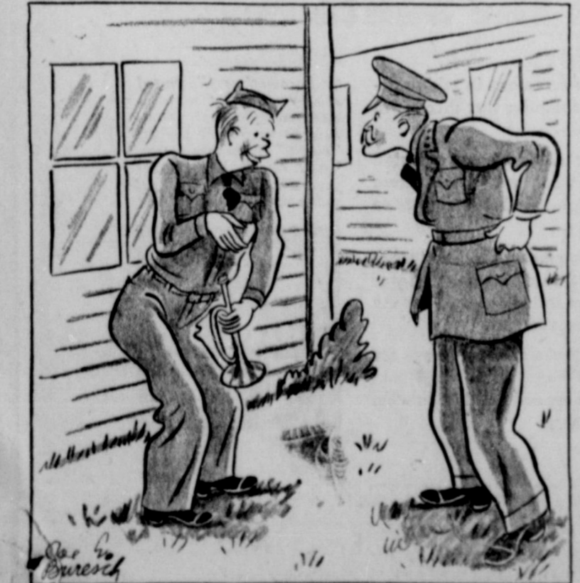
"Oh, I'm not the regular bugler, sir. He wanted to snatch an extra wink this morning."