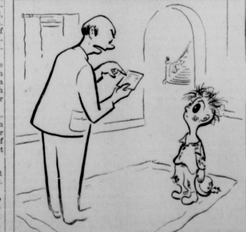
"I'm surprised at you, Rodney. Sixty-five in spelling"