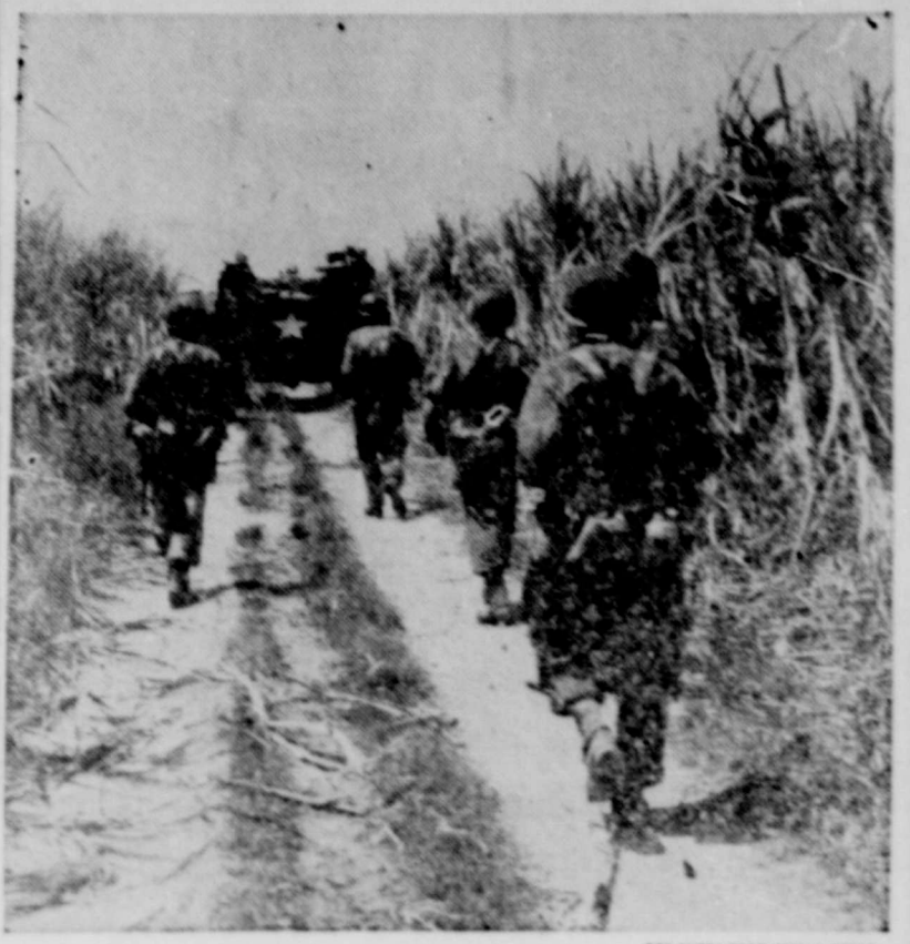
On Saipan, Yank infantrymen advance through a sugarne field behind a self-propelled gun mount moving up to Jap pillroxes that are holding up the American in-