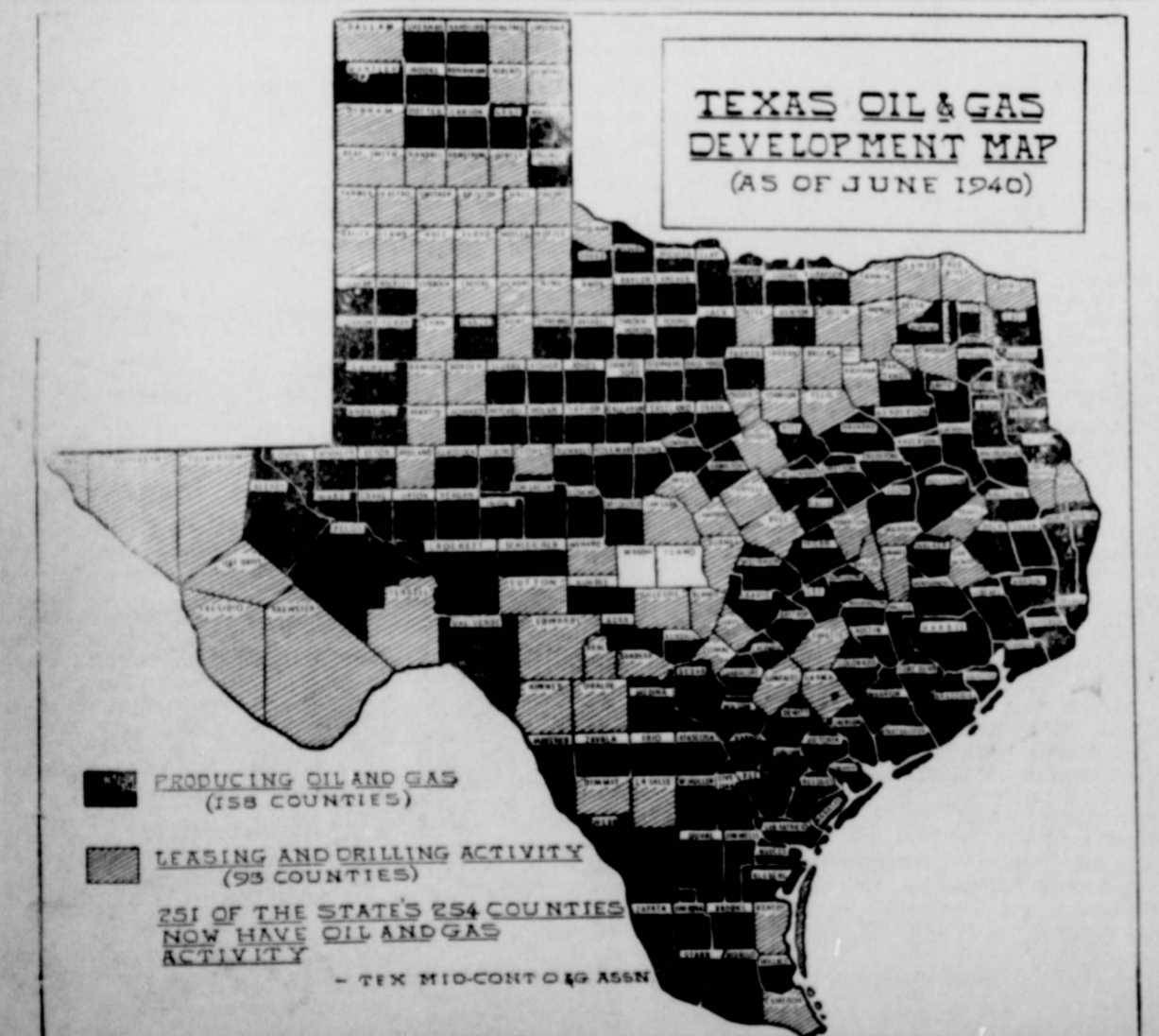
All but three counties in Texas, as of June this year, had some sort of gas and oil activity, the above map indicating where actual production is and where oil and gas leasing and drilling activity has been done. The map is from a survey of the Texas Mid-Continent Oil and Gas association.

"During the past few weeks, there has been a totally unexpected and unprecedented spread of damage to the cotton crop caused by what is known as the 'cotton hopper' or the 'cotton flea.'"