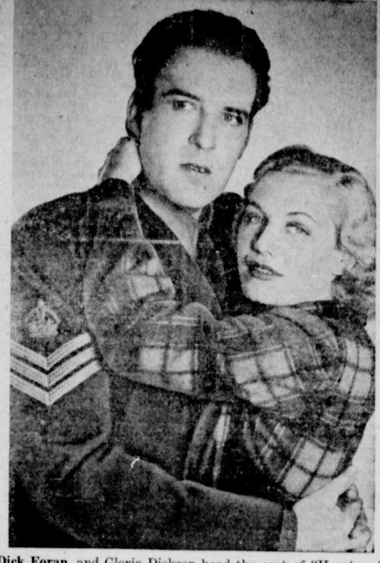
in which silage has been used. Oth- Dick Foran and Gloria Dickson head the cast of "Hearts of er cattle fed heavy grain ration have the North," technicolor epic of the adventures of the Canadjust been marketed, and several ian Mounties coming to the Palace on Saturday.