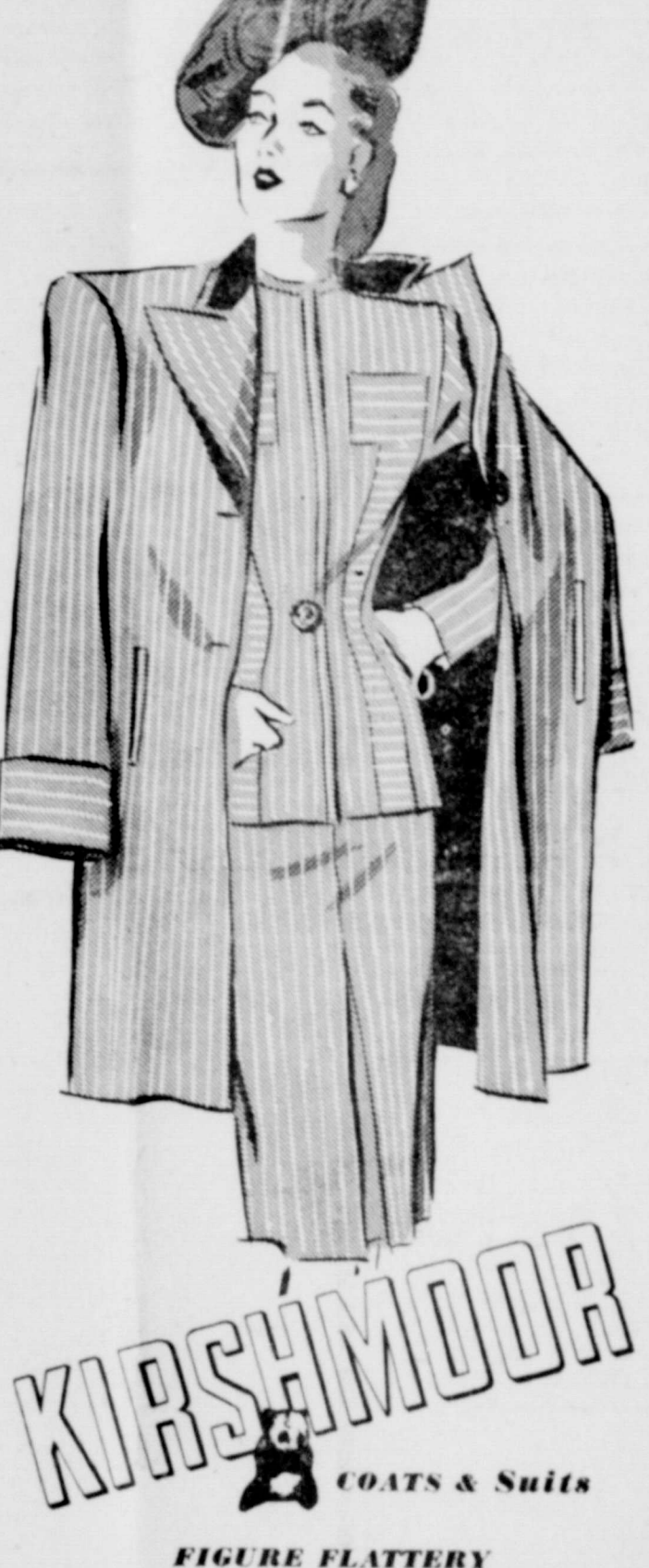
FIGURE FLATTERY BY KIRSHMOOR

expressed in the deep brown tones of Mouton lamb used in tuxedo lines on a flange shoulder coat of all wool . . . lamb's wool interlined for extra warmth. Companion suit is detailed for a lithe and slender lock. 12 to 42.