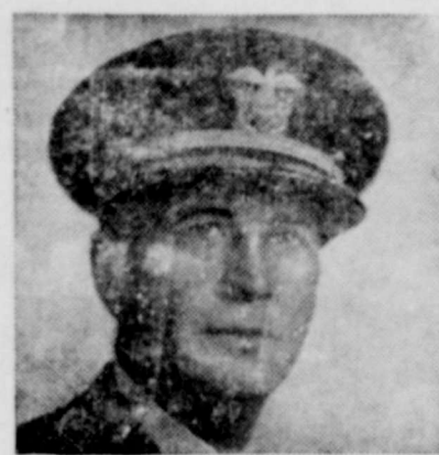
ADMIRAL KING: "Because the Navy shares life and death, attack and victory, with the men of the United States Merchant Marine, we are fully aware of their contribution to the victory which must come."

"UP-GRADING IS FAST," say Men Now at Sea!