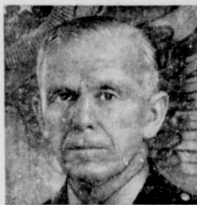
GENERAL MARSHALL: "The men who sail merchant ships are making it possible to transport fighting men and supplies . . . to defeat the enemy. The Army is deeply indebted to these men for their unceasing efforts . . . to hasten the day of victory."