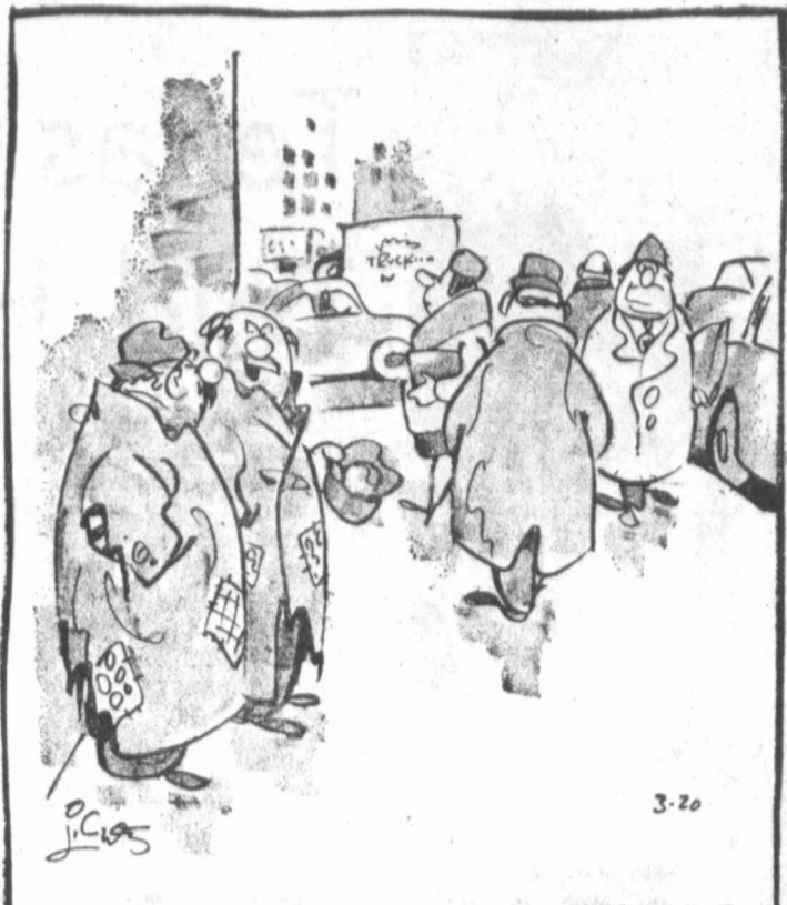
"I hate income tax time!... It's an almost unbearable strain trying to top THEIR hard luck stories!"

Yesterday's Jumbles: COMET VIRUS DEPUTY AERATE. Answer: What one shot sometimes starts - A RACE