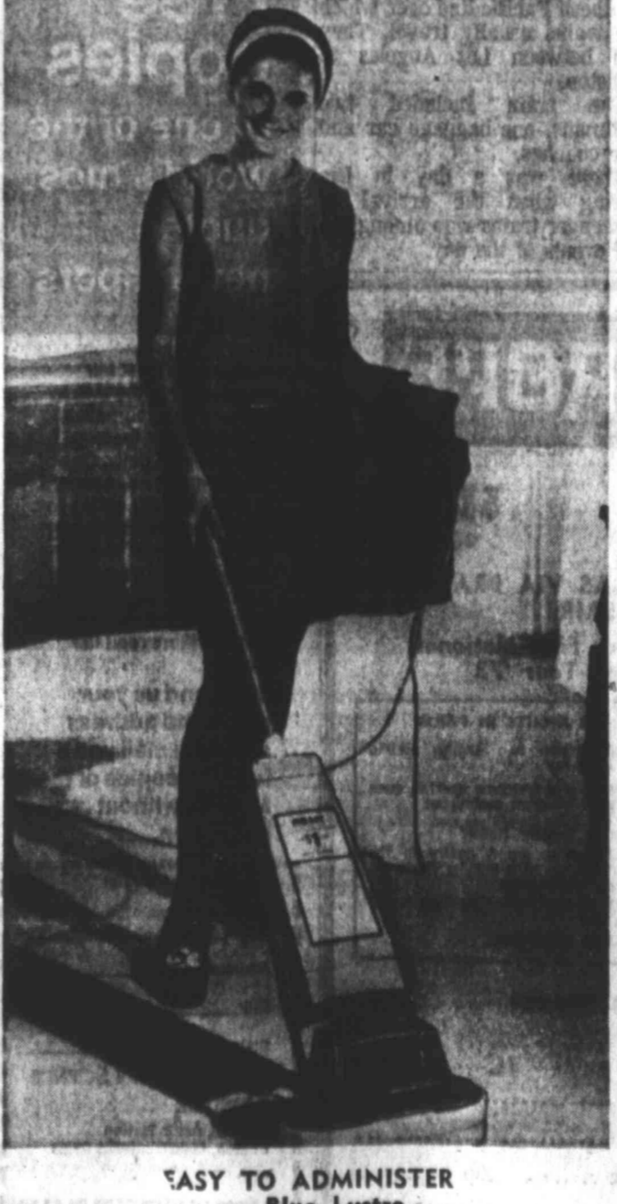
EASY TO ADMINISTER ... Blue Lustre

WASHINGTON (AP) — The Federal Aviation Administration said today it has approved allocations of more than $7.7 million in airport development aid program funds. They include: Adams Field, Little Rock, Ark., $45,000; Robert Mueller Municipal airport, Austin, Tex., $60,500; Sen. Clarke Field, Gallup, N.M., $8,700; Brownwood, Tex., Municipal, $11,600; Harlingen, Tex., Industrial Airport, $5,400.