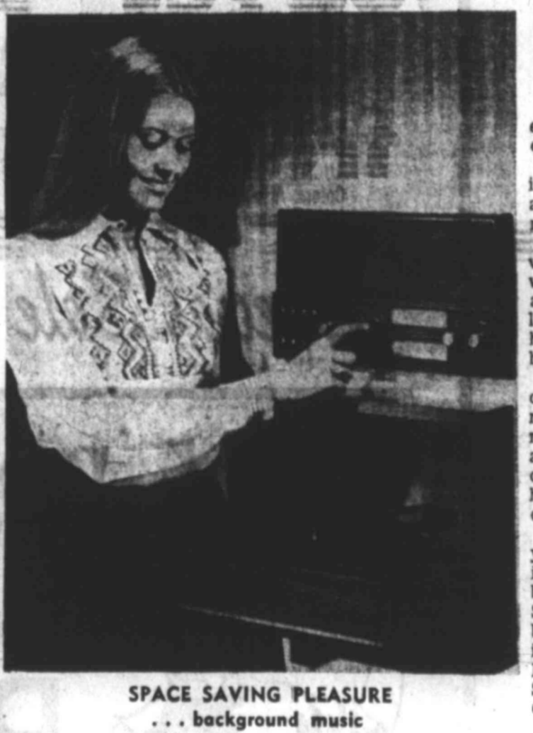
SPACE SAVING PLEASURE ... background music