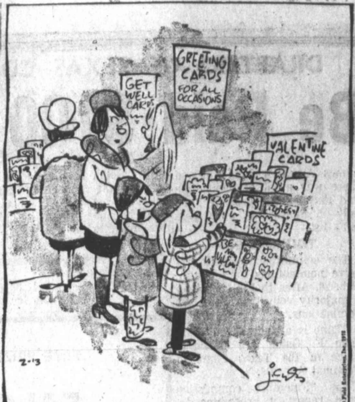
"As a liberated female I'm not going to be anybody's valentine until I've read the contract and job description!"

Yesterday's Jumbles: BULLY SQUAW BETRAY EXPOSE Answers: What the broken piece of sculpture was - A "BUST"