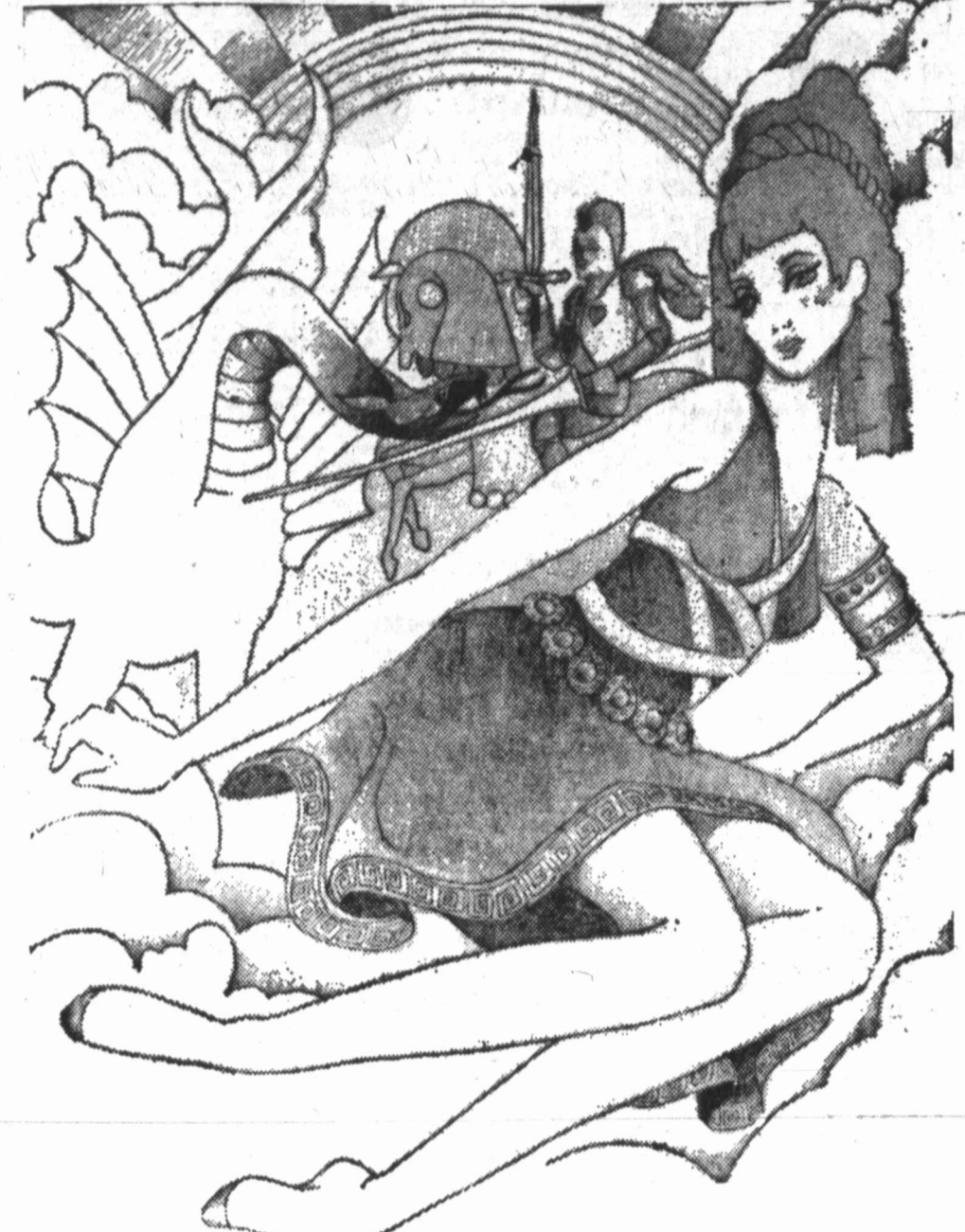
HANES "THE LAND OF SALE" Continues through Saturday, January 24

A new supply of flags has been received and the Permian Chapter of the Noncommissioned Officers Association (NCOA) announced an increase of 25 cents per flag, due to the increase in shipping charges. The total price is $3.50, installed. Residents are urged to purchase one by calling 267-5869 or 263-2904.