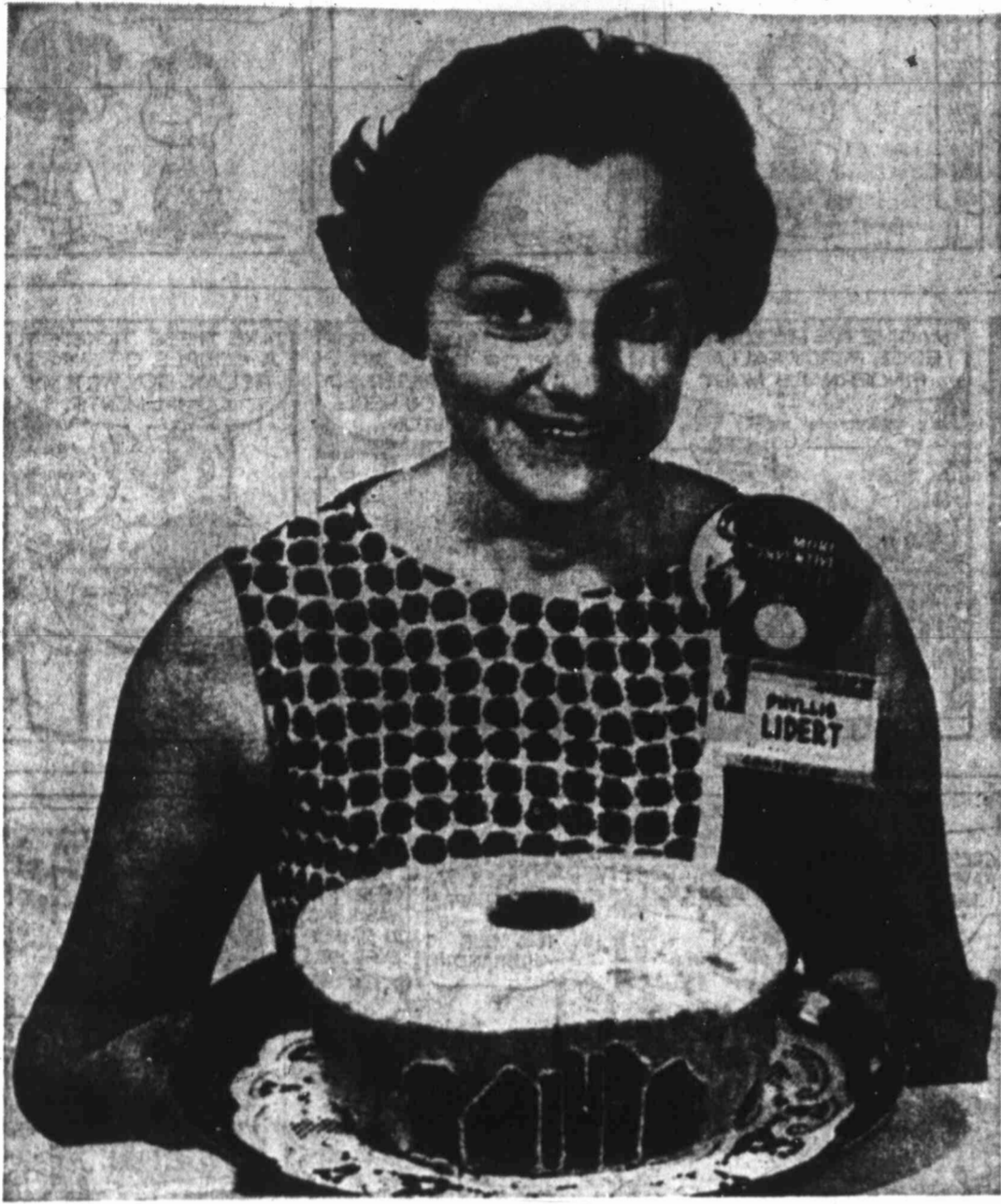
She Wins 'Bake-Off Grand Prize'