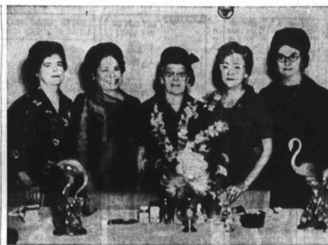
Plan Special Activities