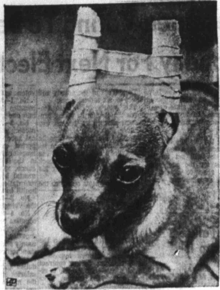
Ready For Football