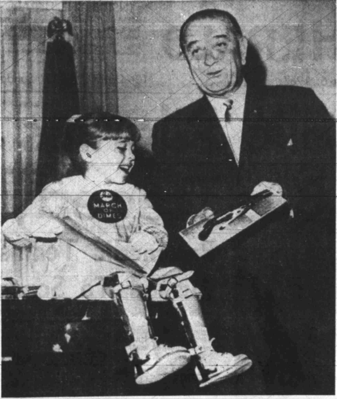
Gifts For A Visiting Miss