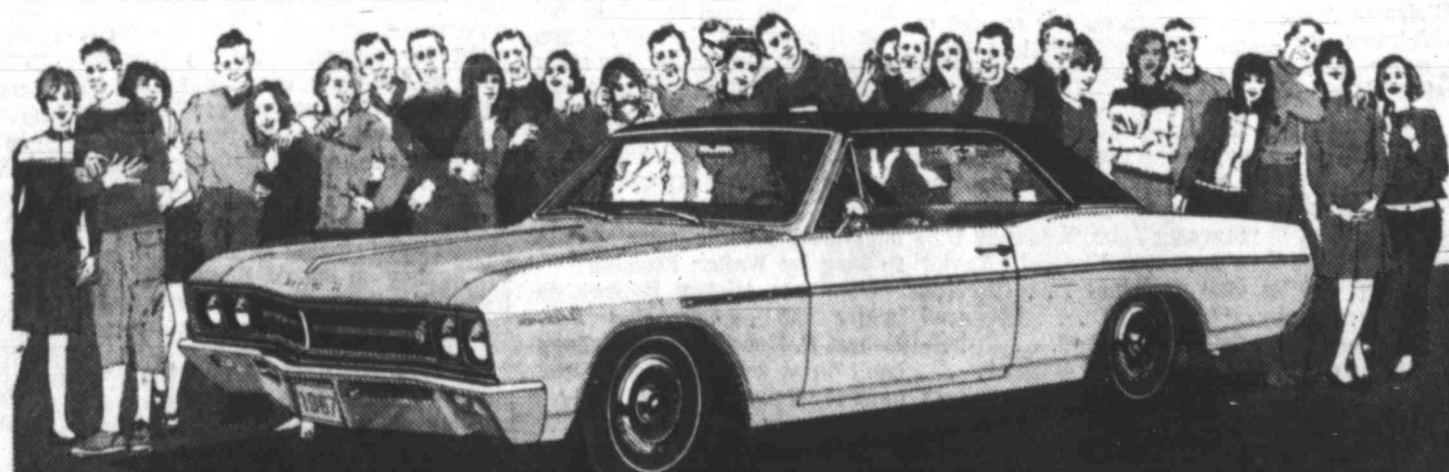
'67 Special Deluxe. Let its low price talk to you.

Jack Lewis Buick-Cadillac, 403-405 S. Scurry Street