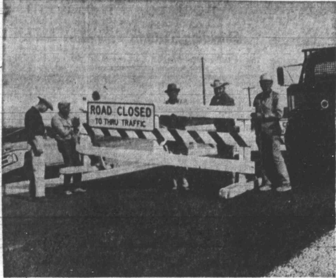
NORTHEAST FM 700 HIGHWAY GOES INTO SERVICE State Highway Department men remove barriers on new loop road

Lucky Strike Green. The fine tobacco cigarette with menthol.