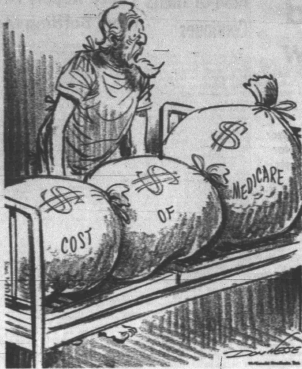
THE HOSPITAL BED IS MADE ...

I thought I had the makings of a nice little feature story today, but if I write it, it is likely that a woman will lose her job.