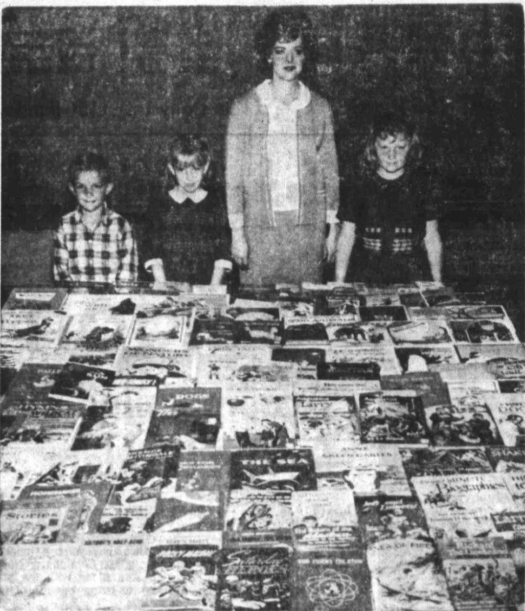
Kentwood Has Book Fair

Kentwood P.T.A. sponsored a book fair Tuesday and today in the Kentwood school for parents of Kentwood children in the first through the sixth grades. Parents had the opportunity to buy a book to put in the school's new library with their child's name inscribed in the book.