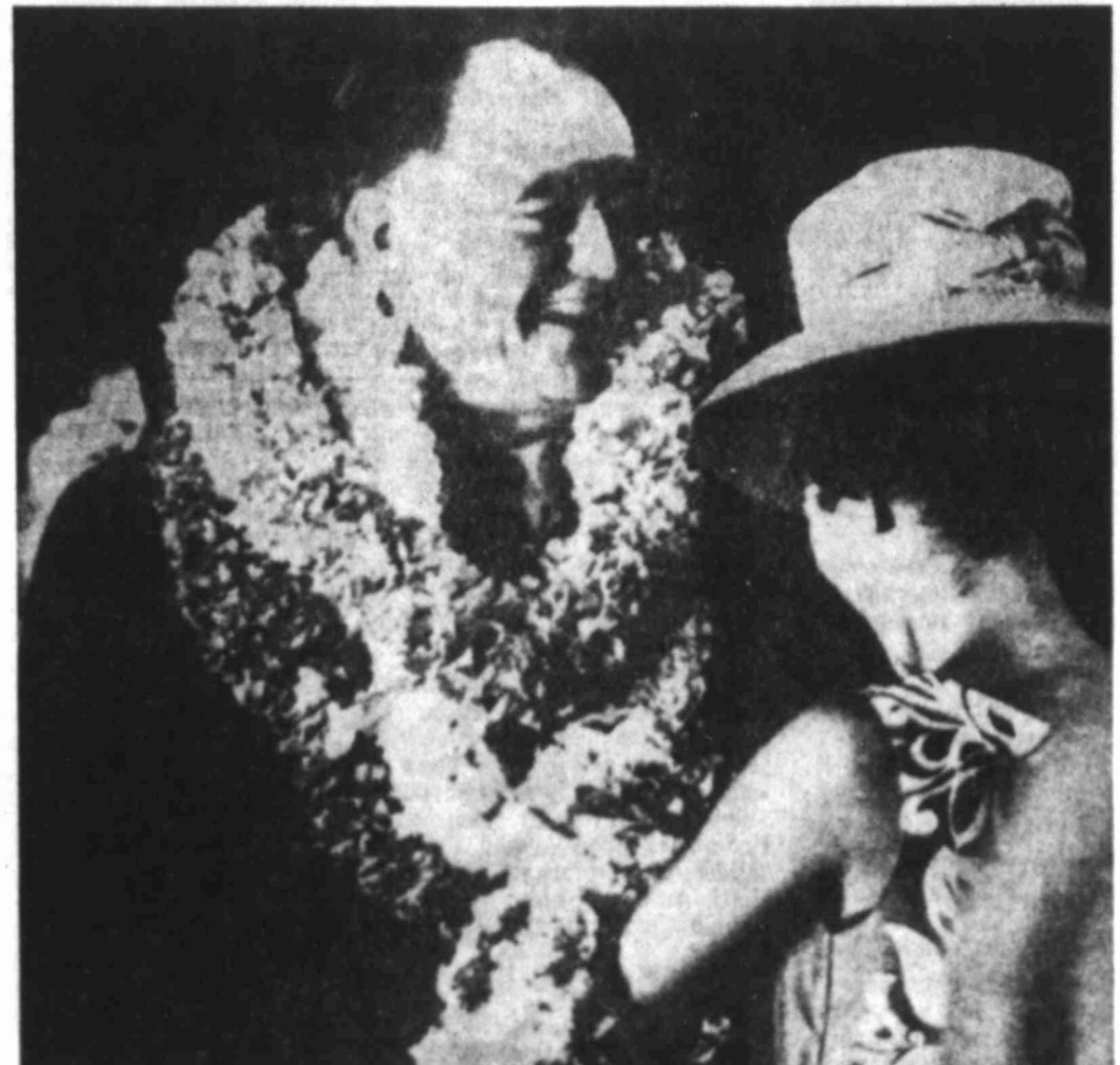
Humphrey Gets Hula Welcome

HONOLULU (AP) — Vice President Hubert H. Humphrey headed for Saigon today to press for vigorous action on President Johnson's demands for political, economic and social progress for warring South Viet Nam.