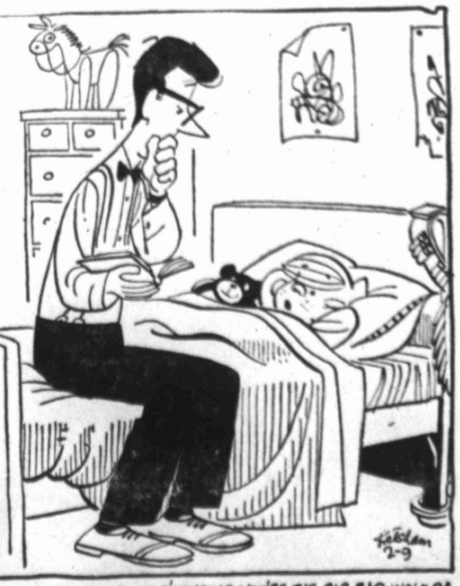
'ARE YOU YAWNING, OR PTENDING YOU'RE THE BIG BAD WOLF?'