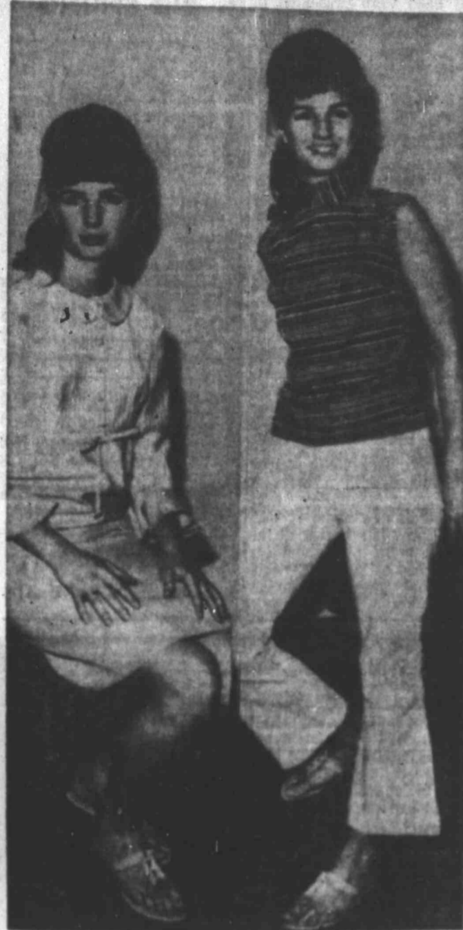
Change To Dress