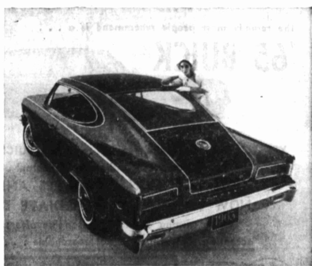
Marlin by Rambler—First Man-Size Sports-Fastback

How much excitement can you stand? Find out today at your Rambler dealer—where the big 1965 1/2 news is! Come try the red-hot new 1965 1/2 Marlin—first and only man-size sports-fastback. Sample the luxury of reclining front seats that glide back and forth for individual legroom. Feel its nimble performance. But be ready for more—in the Marlin, Ambassador and Classic models. The most exciting choice of floor shifts—manual or Shift-Command Flash-O-Matic, teamed with mighty V-8s up to 327 cu. in. Try the sports-car Power Disc Brakes (standard on Marlin) that resist fade on mountain grades, stop safely even in a drenching cloudburst. See the new leather-grained black vinyl roofs available on Rambler hardtops. Look at the all-new Ambassador and Classic convertibles—or the American, lowest priced U.S. convertible.