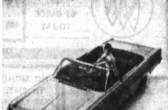
Ambassador 990 Convertible

Go where the 1965 1/2 excitement is—Rambler dealers' Sporting Spring Deal Days!