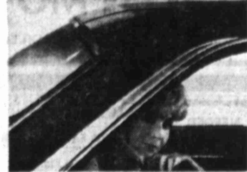
Leather-Grained Vinyl Roof world trade-in offer on the Rambler of your choice. Come in today. American Motors—Dedicated to Excellence