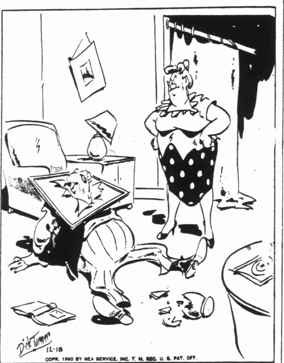
"Sometimes I wish I had let you go ahead and sue me for breach of promise!"