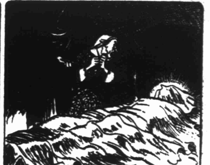
Then they saw the dead man, unattended by friends or mourners. Scrooge was moved. "The case of this unhappy man might be my own," he wept.