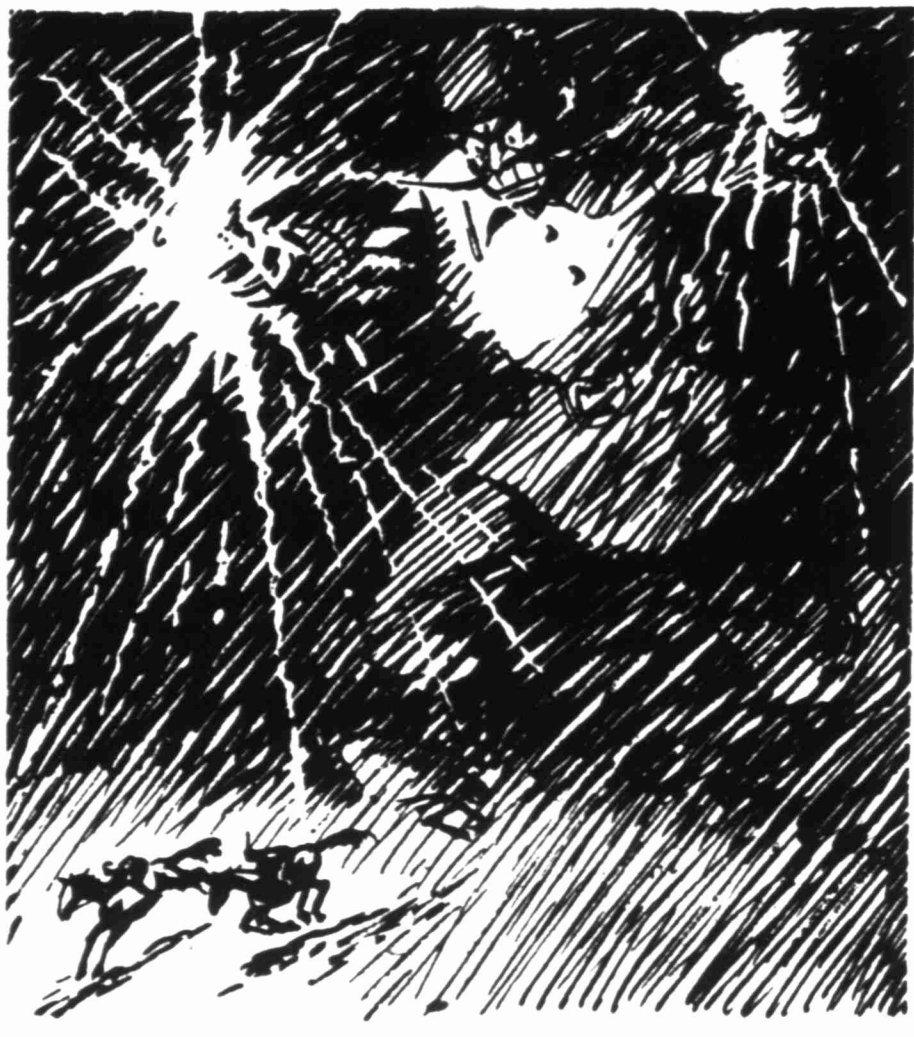
The great giant gathered ribbons of color in his huge fists and shook them after the fleeing boys.

At last there was a wild whoop from the Jindians. "He comes! He comes!"