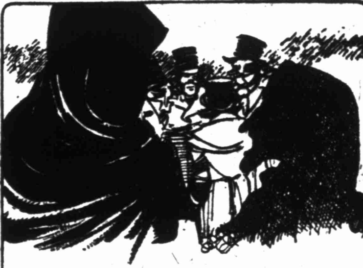
Scrooge and the Ghost of Christmas Yet to Come overheard a group of businessmen. "I thought he'd never die," said one. "What has he done with his money?" asked another. "He hasn't left it to me!" laughed a third.