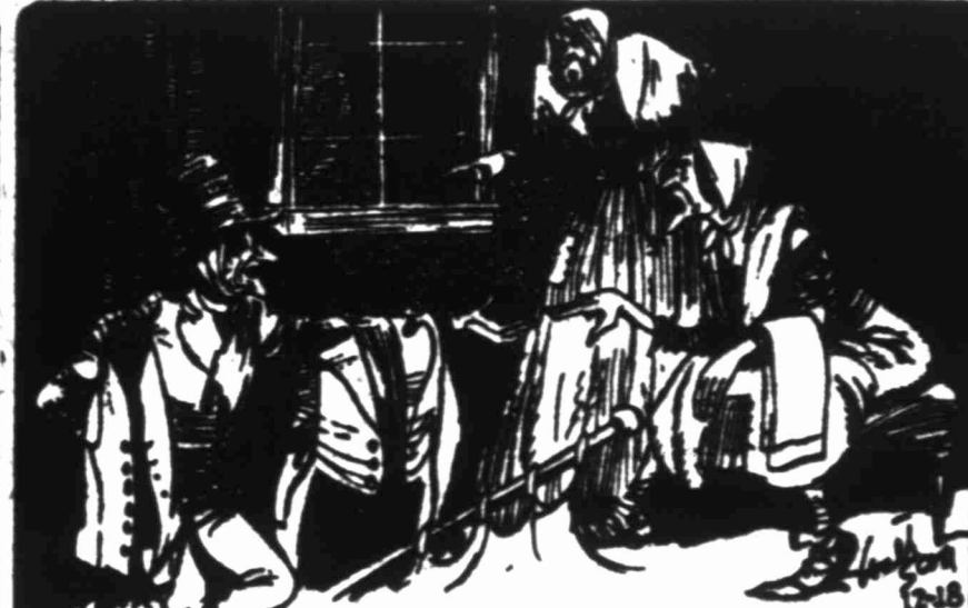
The Spirit took Scrooge to a vile part of the city, and showed him, in a wretched hotel, a group of barflies haggling over the personal effects of the dead man.