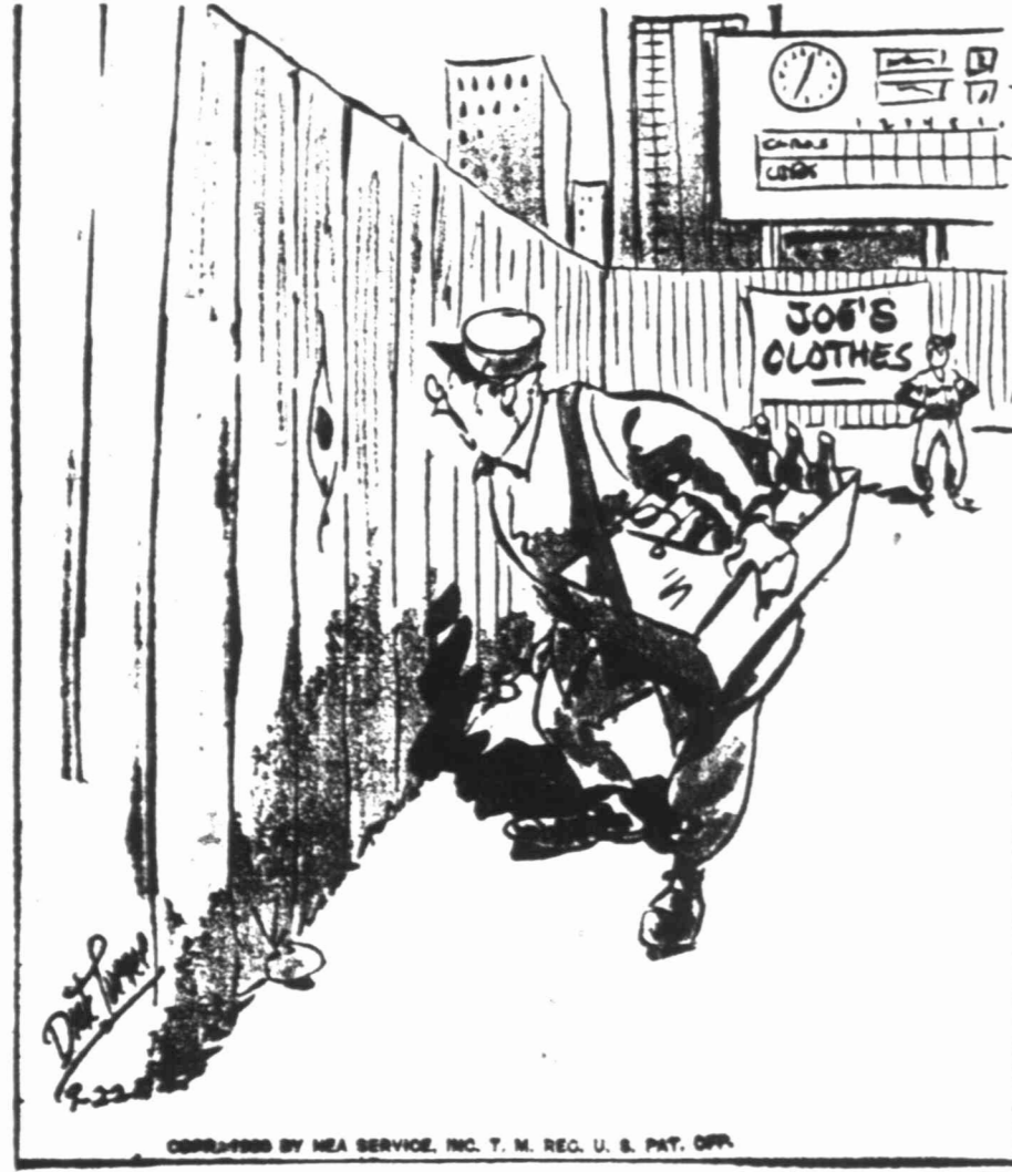
"Candy, soda, hot dogs?"