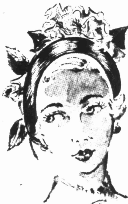
as shown, 10.95

The new Spring collection of Parkridge exclusive straws are in our stocks now—fresh from their tissue paper wrappings—lovely as the first blooms from your garden. Exquisite straws—like our finely sewn Pettiper bumper profile hat we've sketched, with exciting flowers rising from its crown. It's time for a new hat!