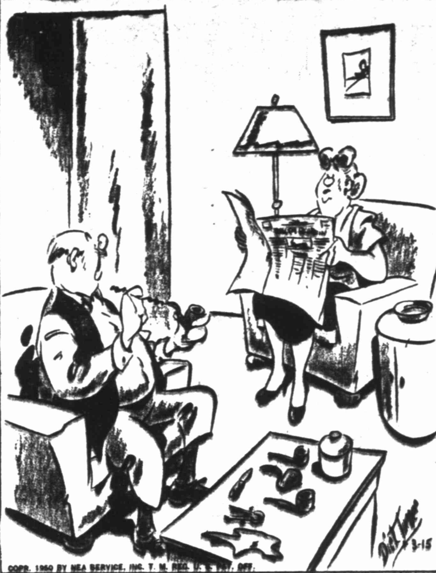
"What do you mean, 'they're not sure the H-bomb will work?' Haven't they already scared everybody to death with it?"