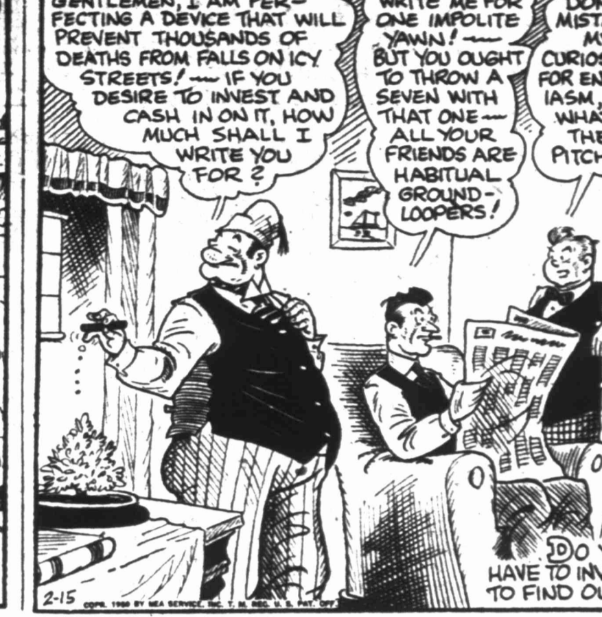
DO YOU HAVE TO INVEST TO FIND OUT?