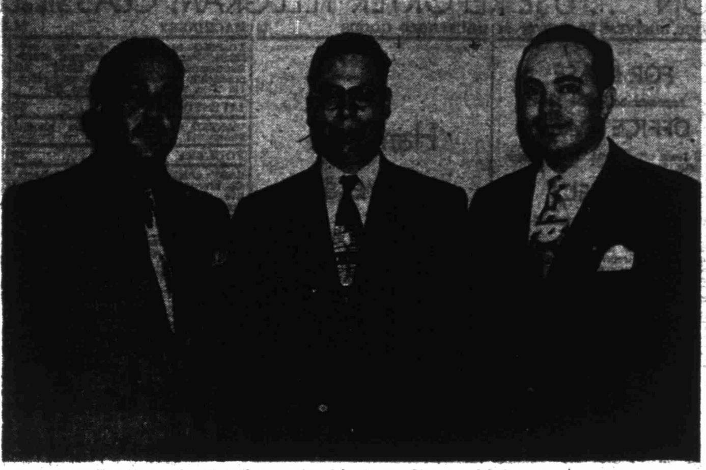
These three Egyptians, oil well drillers employed by Socony-Vacuum Oil Company, currently are on a tour of duty in the Pegasus field in Midland and Upton Counties. The methods they are learning here will be put to use on their return to work in the Egyptian oil fields.