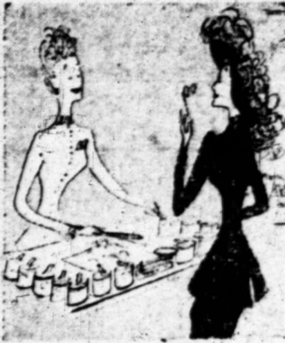
MADE-TO-ORDER FACE POWDER Introductory box $1. Other sizes $2, 3, 5. Plus tax

"If you want a face powder that is always fashion correct—that does something for your distinctive coloring, come in today for a personal study by our Consultant. Our Consultant will blend your very own face powder right before your eyes."