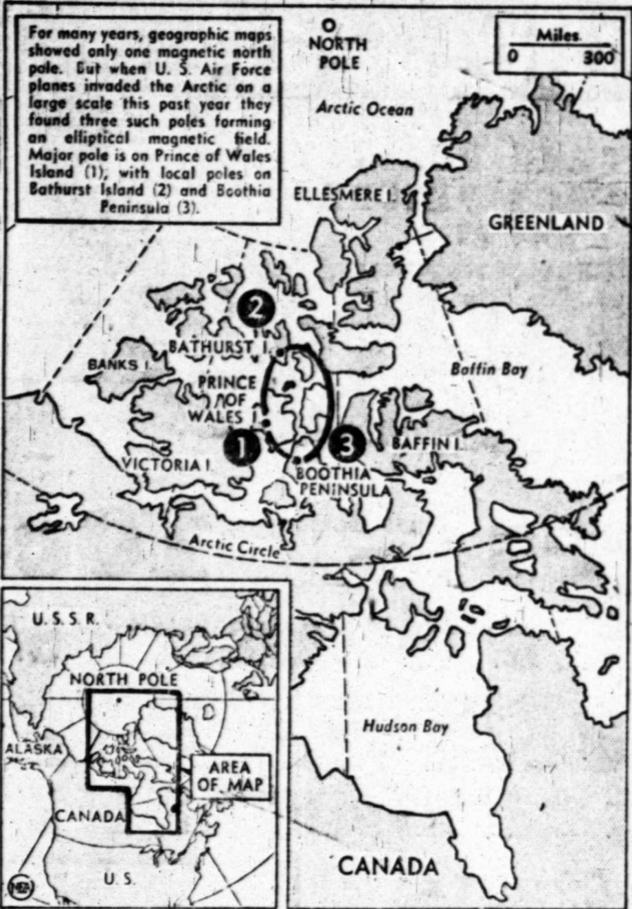
Map shows location of the three new north magnetic poles forming an ellipse shaped magnetic field recently disclosed from Air Force flights over the North Pole from Alaskan bases. The discovery is expected to prove important in trans-Arctic aerial navigation.