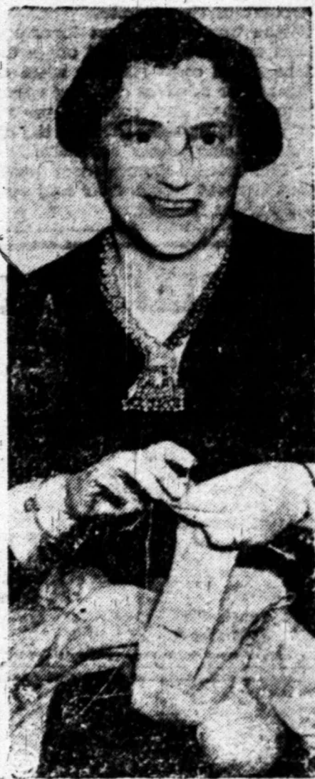
The Motherly mien hides political acumen.

have worked for him. Perhaps not so hard—but I would have worked."