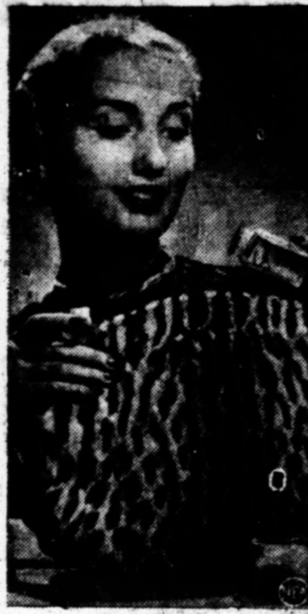
Sachet dusted into muff lining leaves a lingering fragrance.

By ALICIA WART NEA Staff Writer Does your budget say "no to good perfume?" Settle for sachet. Our grandmothers found this perfumed powder to be most satisfactory as "come-hither" during their day. Now sachet is a modern perfuming aid, as popular as it was during the turn-of-the-century. It bows back to a modern encore along with 1900 revival fashions. Sachet concentrates are actually satellites of fine perfumes and duplicate their fragrance with the same kind of essential oils. Small bags of sachet tucked into chests and bureau drawers sweeten bed linens and clothes and make up for sunshine so often denied them with drying on winter's wash-line. Sachet may be dusted into gloves, linings of hand bags, and shoes to pinch-hit for perfume. This highly scented powder is nice to use on furs. Dusted into the lining of a coat or muff, the fragrance lingers and doesn't need frequent renewal.