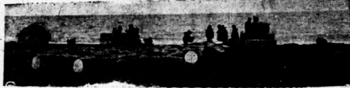
Point Barrow beach: Three weeks to unload for a year.