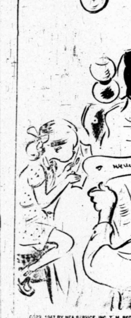
"It isn't bad enough that you read the paper all through breakfast—now the children are getting old enough to read the backs of the cereal boxes!"