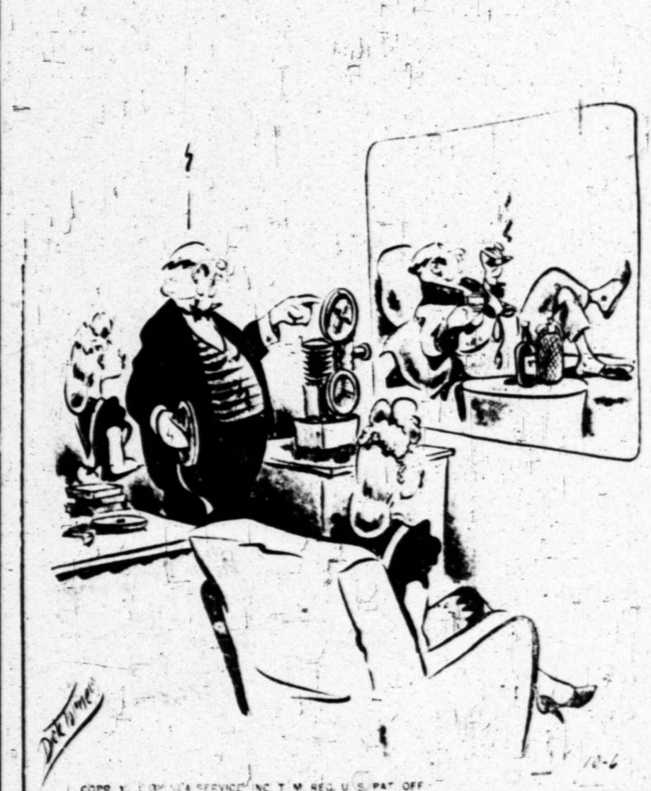
"And these pictures were taken in 1946 while the Tullity was south for the winter!"