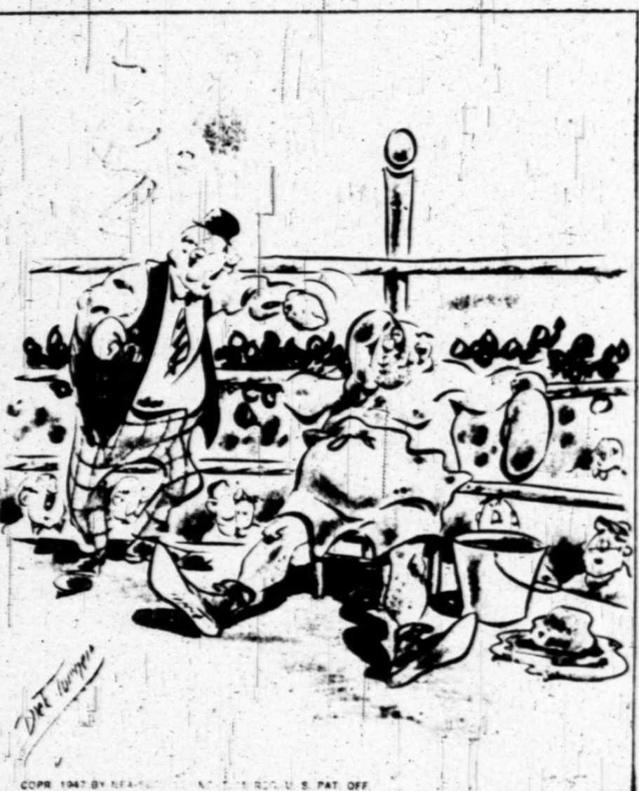
"Use your left! You're making me look like a dope!"