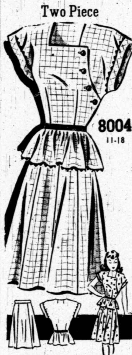
By Sue Burnett

THE REPORTER-TELEGRAM, MIDLAND, TEXAS, SEPT. 5, 1947--3