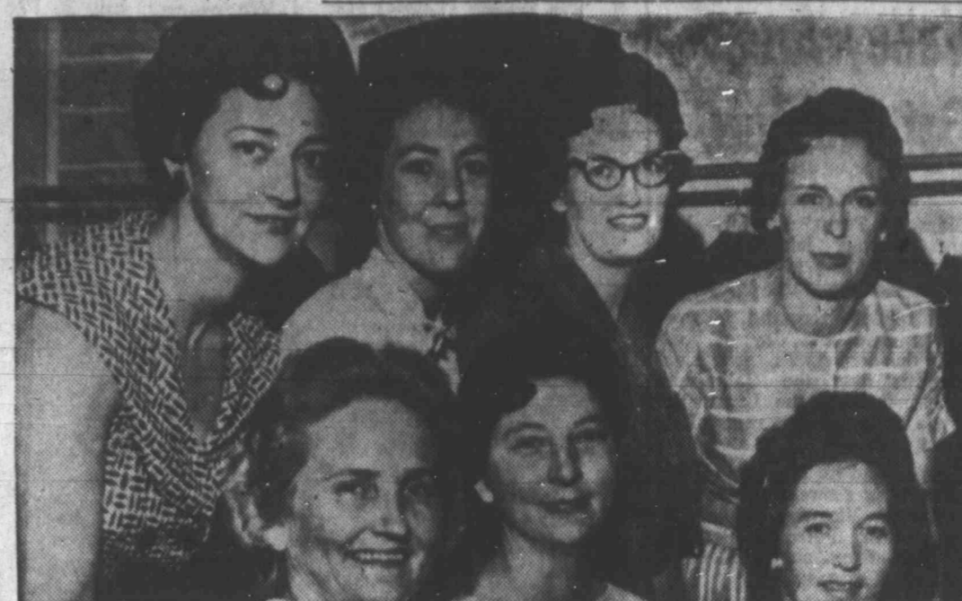
Seven Brides—Once Again

Big Spring (Texas) Herald, Wednesday, July 3, 1963