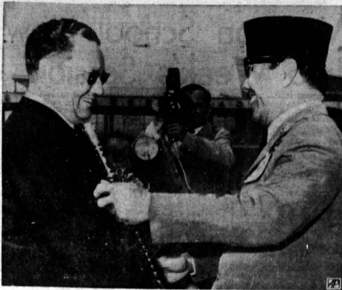
TITO WELCOMES SUKARNO Indonesia's President Sukarno, right, is greeted by President Tito of Yugoslavia on arriving in Belgrade for a three-day private visit