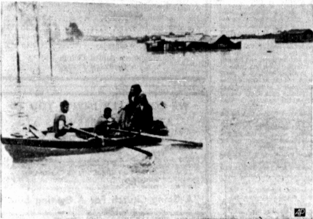
Floods Hit Morocco

Flood victims and their belongings are evacuated by boat from their inundated homes near Rabat, Morocco. Torrential rains have left an un-