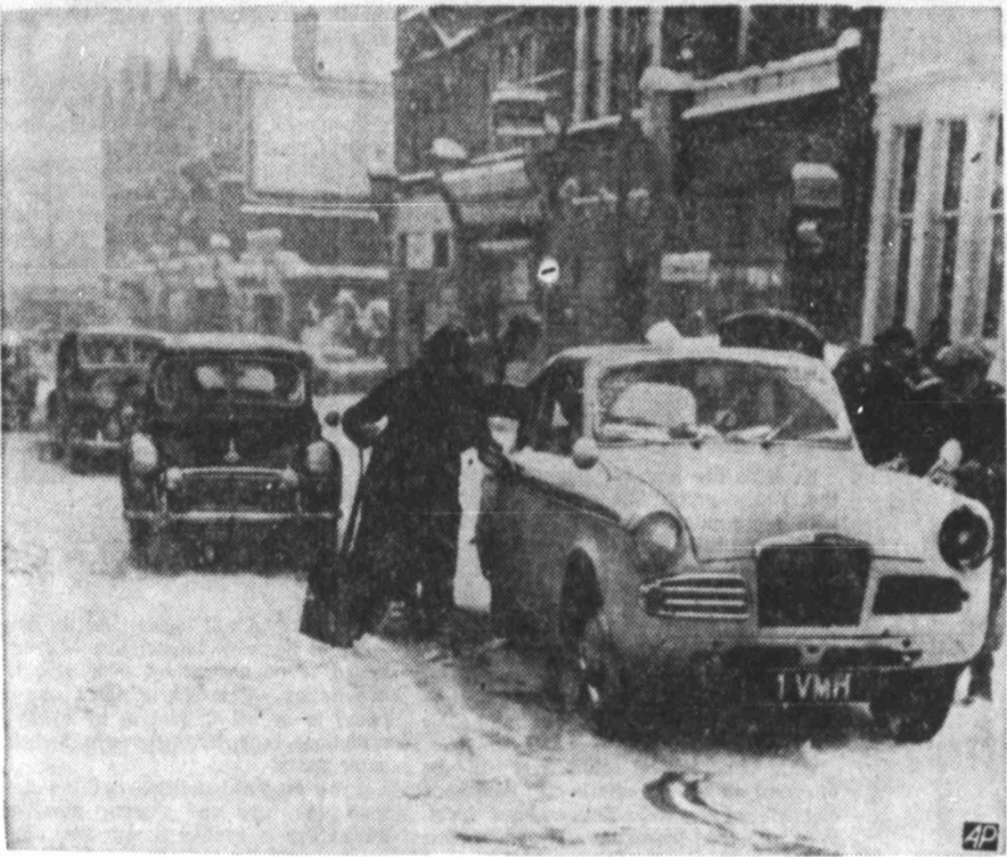
Bobby To The Rescue

A London policeman with a shovel helped free a stalled motorist as a blizzard slowed traffic to a crawl in the British capital. Heavy snow covered the British Isles and freezing blasts swept Europe as far south as the Mediterranean in the bitter winter storm.