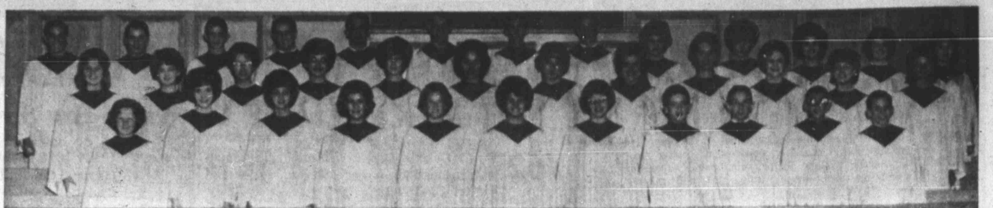
YOUTH CHOIR, FIRST BAPTIST CHURCH OF OAK CLIFF ... will sing here Sunday at Baptist Temple for morning service