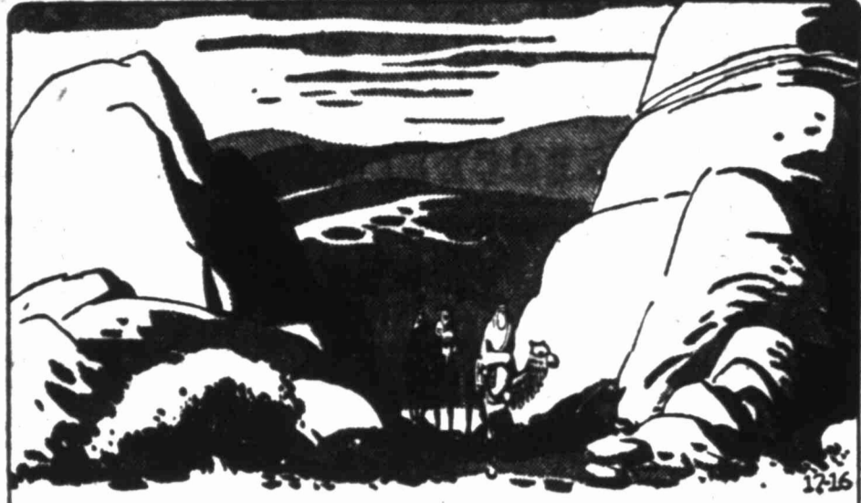
Being warned in a dream not to return to Herod, the wise men returned to their own country by another way. (Matthew 2:12.)