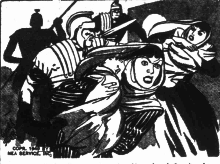
Then Herod's fury knew no bounds. He ordered the slaughter of all the boy babes in Bethlehem, hoping thereby to destroy the Christ-child. (Matthew 2:16.)