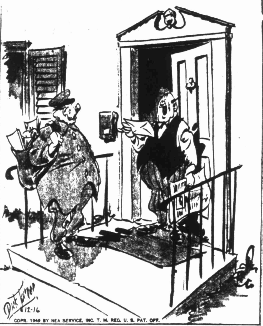
"It's addressed to 'Home Owner'—maybe you'd better forward it to the Jim Dandee Finance Corporation, at Main and Broad!"