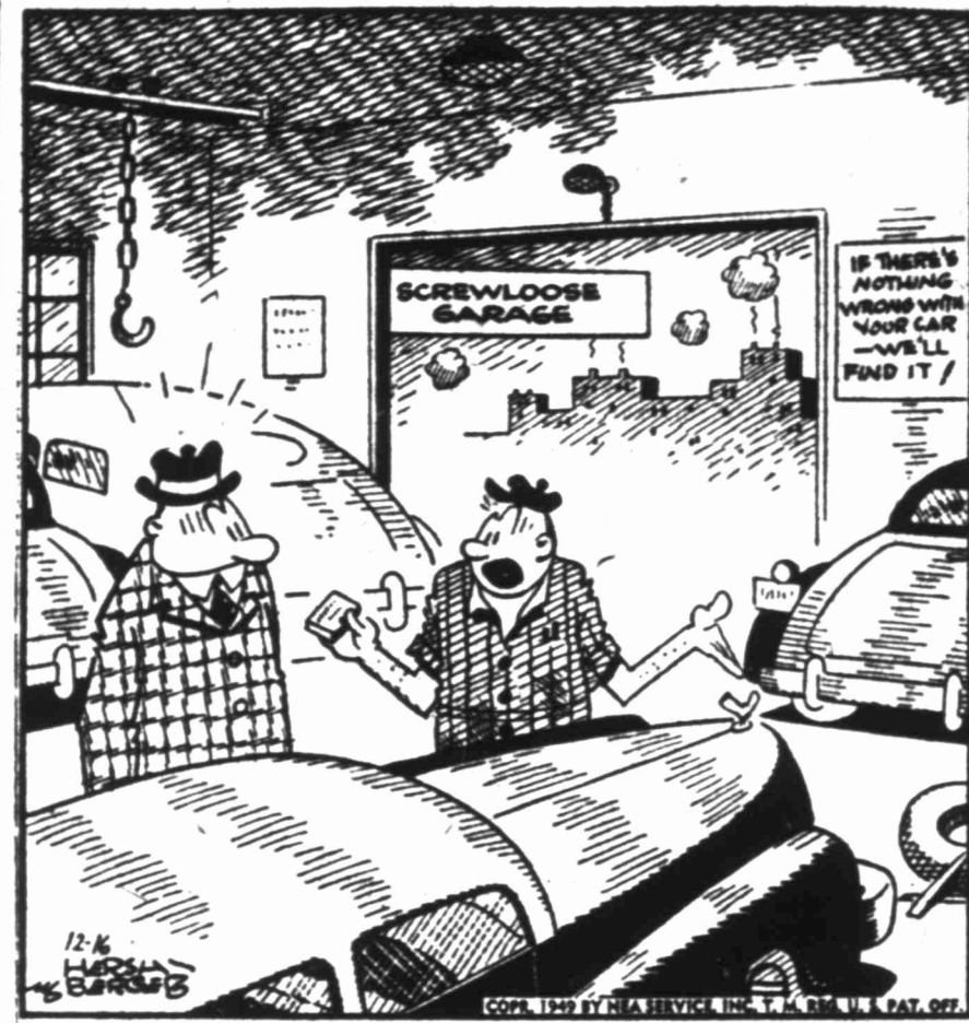
"We couldn't find the rattle, but here's a box of headache tablets and you won't mind it so much!"