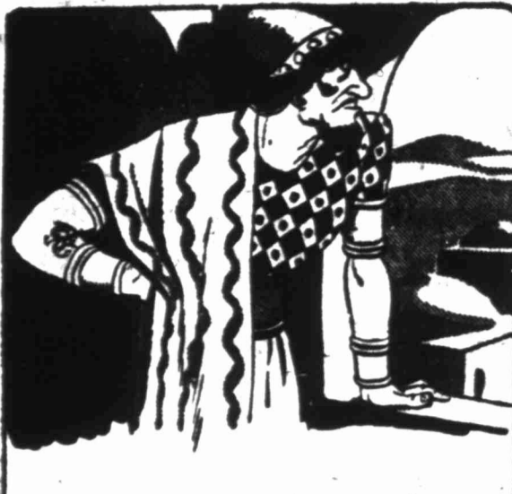
Herod had bade the wise men return when they had found the baby, that he might worship him also, but evil was in his heart to destroy the child.