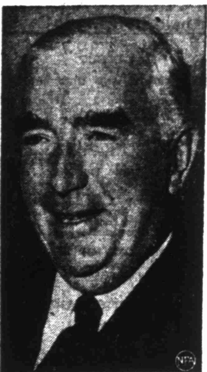
Conservative Robert Menzies is Australia's new prime minister. He is the leader of the coalition of Liberals and the Country Party that swept Australia's eight-year-old Labor government out of office in the recent elections.