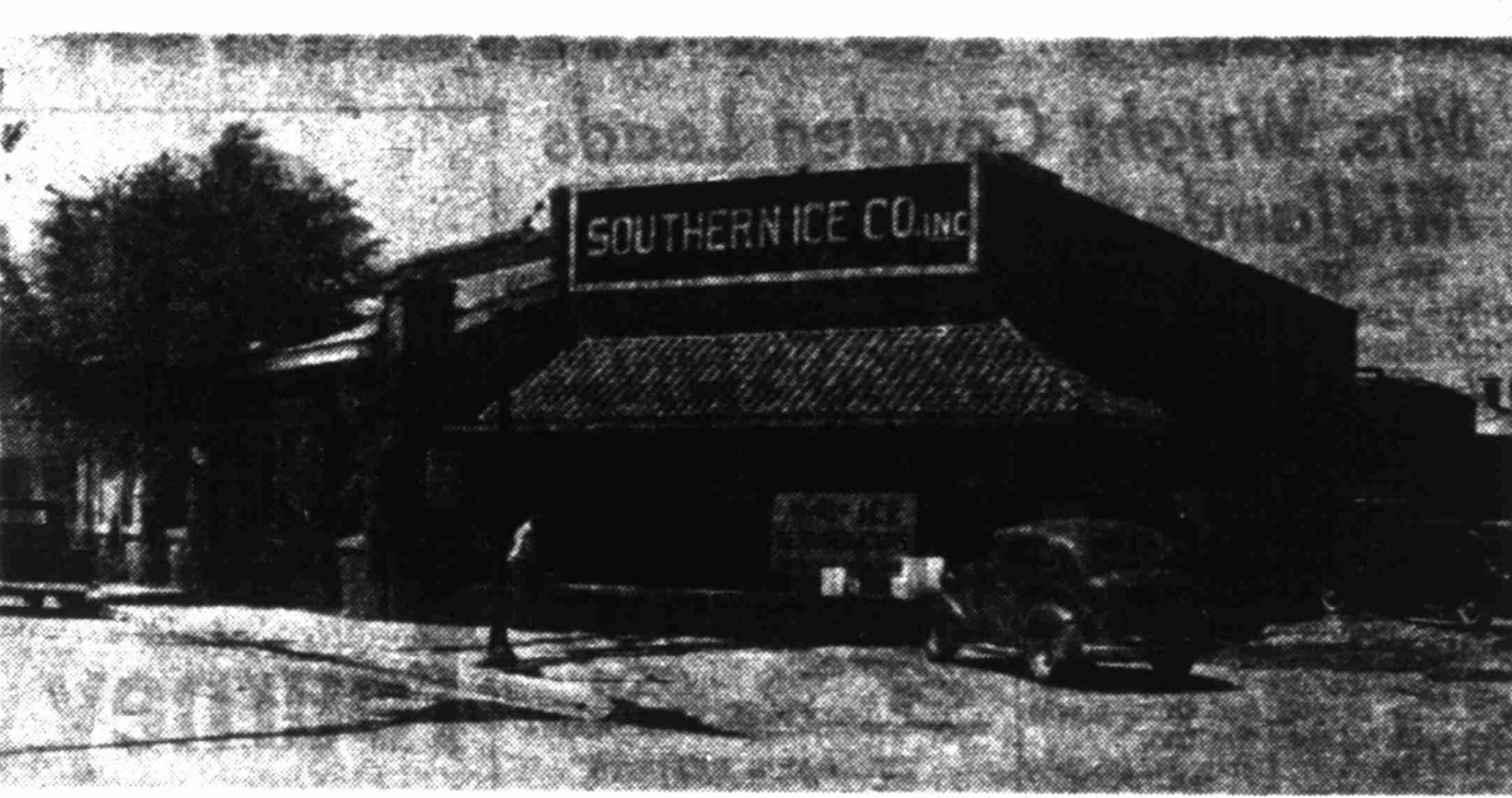
Southern Ice Company, Inc., at 310 South Main Street in Midland, is equipped to keep ice users in good supply, regardless of the demand for ice which might result from a prolonged and unprecedented heat spell. New machinery installed recently insures adequate production of the product which is so popular, for a wide variety of uses, among residents of Midland and vicinity. The convenient docks at the downtown plant make for the utmost convenience for motorists. A delivery service also is maintained. Lee Weathers is the manager of Southern Ice. The telephone number is 5-41-17-e.