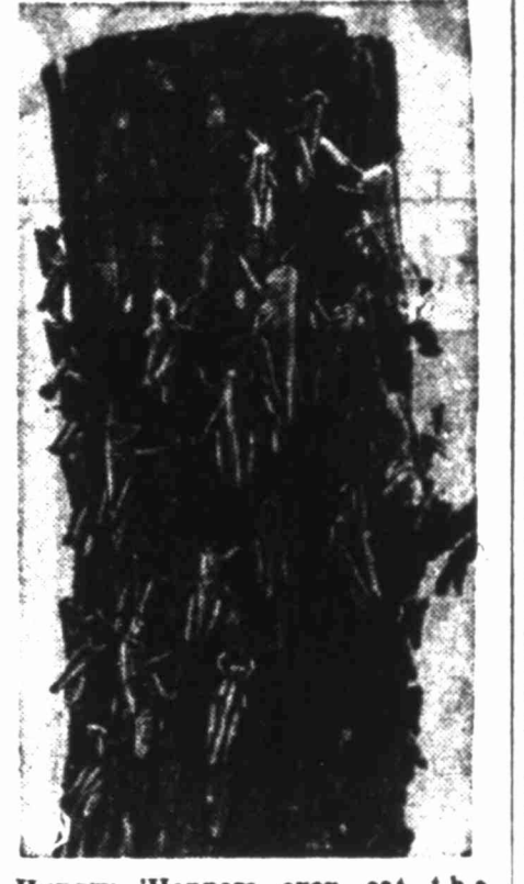
Hungry 'hoppers even eat the bark of the tree on their marches.

By DOUGLAS LARSEN NEA Staff Correspondent WASHINGTON—U. S. Department of Agriculture experts saw this summer's grasshopper outbreak coming three years ago, but grasshoppers are just as intractable as they are predictable. Few other insects multiply so efficiently.