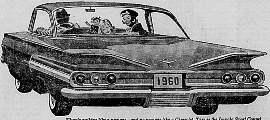
There's nothing like a new car—and no new car like a Chevrolet. This is the Impala Sport Coupe!