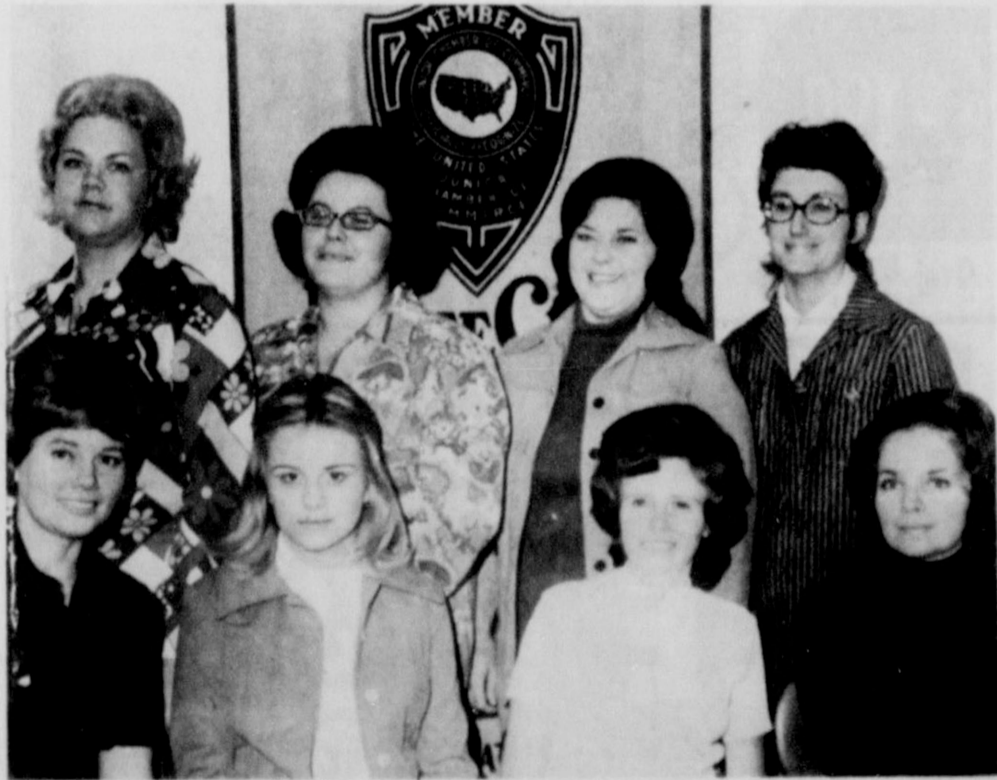
Friona Jaycee-ette Officers & Directors