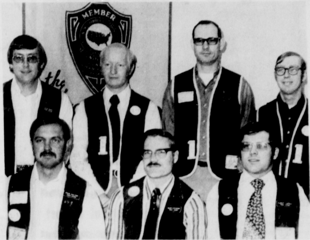
Friona Jaycee Officers & Directors

Are you a young man between the ages of 21-36 whose purposes are broader than those of any other civic group? The Jaycees on the local, state and national level, exist for two main reasons leadership training and individual development of our members through community service and civic betterment programs. A. WHAT ARE THE JAYCEES 1. A group dedicated to leadership training through community development 2. Fastest growing young men's organization in the world 3. International in scope--chapters in 75 countries. B. WHAT THE JAYCEES ARE NOT 1. A political organization (although interested in governmental affairs) 2. Eat, meet and go home and forget it club C. SOME OF OUR REWARDS 1. Association with other young men in your community 2. Leadership development through active participation 3. The opportunity to improve your community 4. A chance to be a leader in your community 5. Make friends and establish social contacts 6. Formal training, such as public speaking experience 7. Self-satisfaction, the greatest award of all