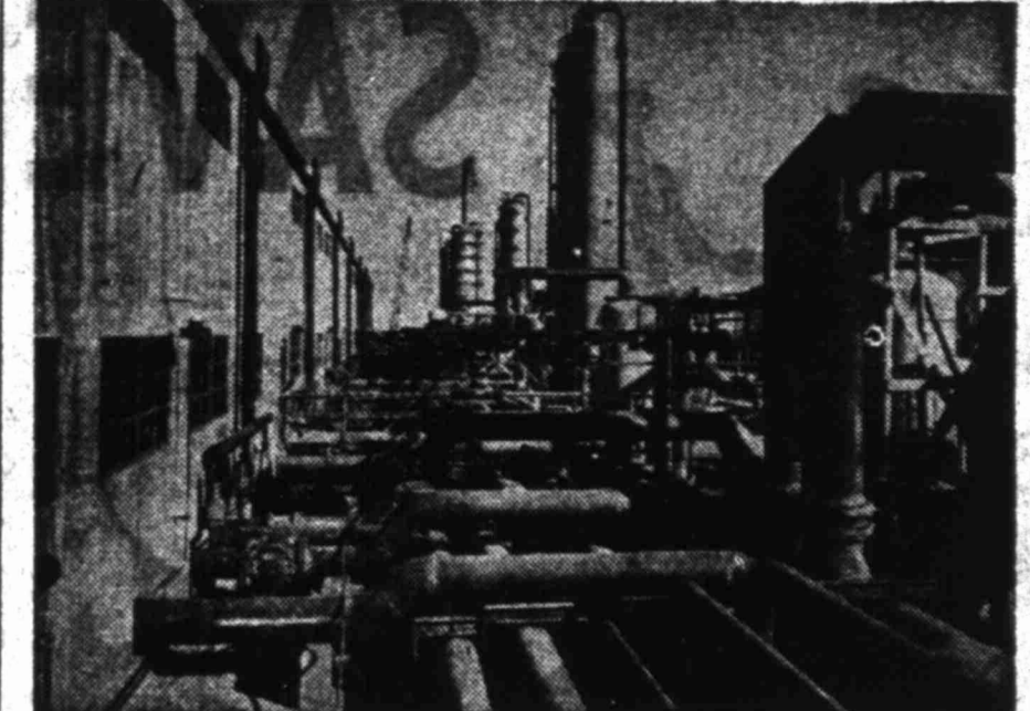
Work on the new Slaughter gasolin plant is being rushed to completion. Picture shows compressor piping along the side of one of the compressor houses in the new plant, which is being built by Stanolind Oil & Gas Company.